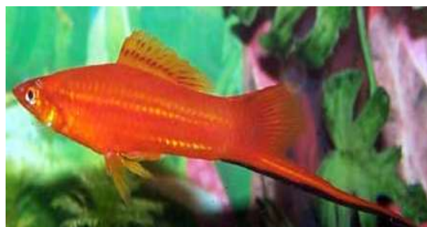
Figure 2: Mature male swordtail molly