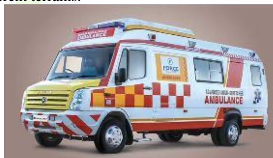
Figure1: Existing ALS Ambulance

VI. The various problems and difficulties faced by the end users of ambulance is generated through primary and secondary research. The access to all the equipment by the technician without moving from the seat is an issue. The technician has to move around in the patient compartment to access to all equipment and medicines as well as the patient. The availability of rear door alone for taking in and out the stretcher is difficult at times. The bulky design of the vehicle makes it difficult in maneuverability in certain conditions. The vehicle can perform on normal road. However, is stuck in other terrains. The lack of mechanicals as well as design limits the vehicle to go through different terrains.