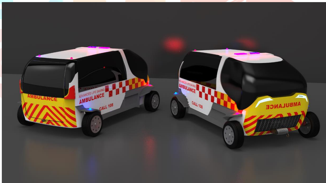
Figure 3 : Exterior Design