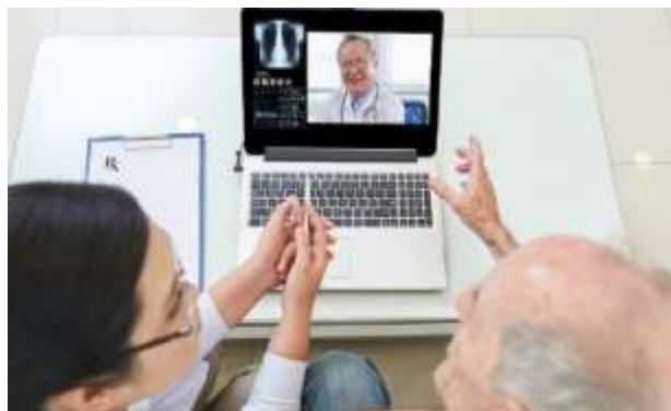
Figure - 8: Telemedicine.

In these pandemic times, many governments, hospitals, e-pharmacies and even health care practitioners have adopted to telemedicine which would protect the patients and the doctors from virus transmission, and does not disrupt the lockdown measures. Telemedicine is well suited for scenarios in which medical practitioners can evaluate and manage patients by providing medical services using the technological advances like video calling to guide the patients rather than bringing them to hospitals. A telemedicine visit can be conducted without exposing staff to viruses/infections. Basic facilities like availability of high-speed internet and video conferencing through webcam or smart phone are adequate, if the doctors need to advise patients on minor ailments such as cough, cold or check their diagnostic reports to prescribe medicine. Even the psychologists and other medical personnel have teamed up with industries to suggest employees on things like how to fight stress, boredom and other issues. The pharmacies are giving medicines using online services and door deliveries.