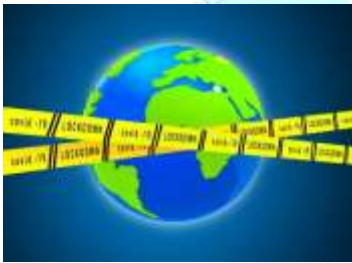
Figure 2: World Lockdown

The China government has decided to lock the city of Wuhan and took various measures to stop the spread of this virus. It has imposed international travel bans, shutdown of all public places, shopping malls, schools, offices, etc. to stop the spread of virus. China took aggressive action at the start of outbreak, shutting down transportation in some cities and suspending public gatherings. Officials isolated sick people and aggressively tracked their contacts, and had a dedicated network of hospitals to test for the virus. And the measures proved to be effective in stopping the spread of this virus. Most of the countries that presently have a high rate of spread of the virus are still viewing the lockdown as the only option to control the virus. The relaxation has been given to emergency services and essential services to avoid the public from gathering outside for any type of activity.