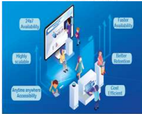
Figure - 6: e-Learning.