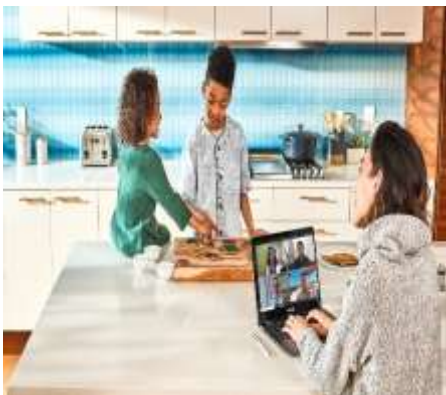
Figure - 5: Work from Home.

Structure your day, when you are working from home. You have to be your own manager and therefore you have to manage your work and health. Provide yourself with breaks so that you can keep focused and avoid burnout. Apart from work, one can improve their state of mind by being with their families sharing household chores, dealing with child care issues and even watching television together can bring families closer.