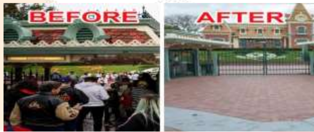
Figure 3: Disneyland Closed due to Covid-19.

The sudden lockdown has largely impacted on all the sectors due to thinning of financial cycle all around the world. As all the public places, gatherings, workplaces, etc. are shutdown except for a few essential services it has led to the fall down of finances, shares and all types of incomes. While this is viewed as a big hurdle by most of them, some of them view this as an opportunity to redefine the way things are done. The world of work is severely affected during this crisis; therefore, all sections of society including businesses, employers and social partners must play a role in order to protect workers, their families and society at large.