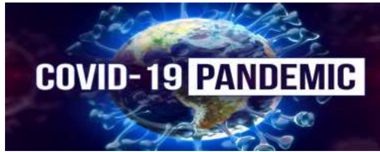
Figure 1: Spread of Corona virus.

The China government has decided to lock the city of Wuhan and took various measures to stop the spread of this virus. It has imposed international travel bans, shutdown of all public places, shopping malls, schools, offices, etc. to stop the spread of virus. China took aggressive action at the start of outbreak, shutting down transportation in some cities and suspending public gatherings. Officials isolated sick people and aggressively tracked their contacts, and had a dedicated network of hospitals to test for the virus. And the measures proved to be effective in stopping the spread of this virus. Most of the countries that presently have a high rate of spread of the virus are still viewing the lockdown as the only option to control the virus. The relaxation has been given to emergency services and essential services to avoid the public from gathering outside for any type of activity.