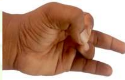
Figure 9. Rudra Mudra

The Rudra mudra is a very powerful mudra. Rudra is another name for Lord Shiva. Place the tips of thumb, ring and index fingers together extend all other fingers in relaxed way.