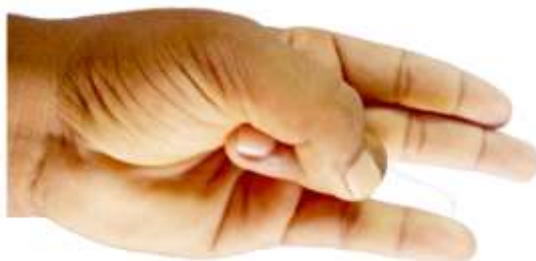
Figure 6. Surya Mudra

Surya Mudra is performed by touching the tip of the ring finger to the base of the thumb and exerting pressure on the finger with the thumb. It helps balances the body, reduces body weight and obesity. It helps to reduces hypertension and cholesterol. It is beneficial in diabetes and liver defects.