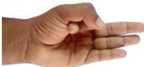
Figure 3. Vayu Mudra

Vayu Mudra, the tip of the index is touched to the base of the thumb and the thumb comes over the finger with a slight pressure of the thumb being exerted. Rest of the fingers remain straight. It helps to relieve from in neck pain and spinal pain.