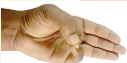
Figure 5. Varuna Mudra

It's very use full mudra. Varuna Mudra is made by touching the tips of the thumb and the baby finger. The benefits are it improves skin softness also to helps skin diseases.