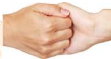
Figure 8. Ganesha Mudra

The Ganesha mudra is linked with the heart. While practice, releasing the muscles of the chest release block in the lungs. Bring both hands in front of your chest with your elbows. Form a claw by bending the four fingers of your left hand with the four fingers of your right hand.