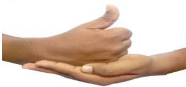
Figure 4. Linga Mudra

The Linga Mudra is so called because it increases body heat by focusing on the element of fire inside the body. Bring both hands in front of your body and clasp them so that the fingers are intertwined. Ensure that the left thumb is pointing vertically upwards and encircle it with the thumb and index finger of the right hand.