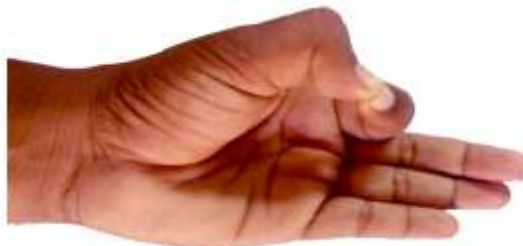
Figure 2. Gyan Mudra

Chin Mudras is improve breathing problems, improve blood circulation and lungs get more oxygen helps to done by touching the tips of the thumb and the index together, forming a round and seated like a meditation posture.