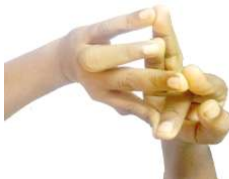
Figure 10. Surabhi Mudra

Kamadhenu is a Sanskrit word which means mother of cows. It is a very effective and powerful mudra. It helps peace in mind and improve concentration. Improve the functioning of the digestive system.