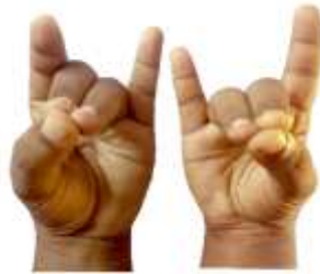
Figure 6. Surya Mudra

Prana Mudra the tips of the thumb, ring finger and the Middle finger are touched together rest of the finger should be upwards. It gives energy, health. Beneficial in diseases of the eye and improves eyesight, raises body resistance to disease.