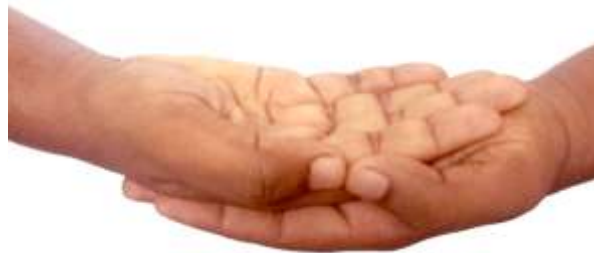
Figure 1. Dhyana Mudra

Dhyana Mudra is most commonly used and observed in Buddhism. Dhyana Mudra has to be done by the two hands are placed on the lap, right hand on left with fingers fully stretched palms facing upwards(thumbs are placed against the palms). It is the symbol of concentration and of the attainment of spiritual perfection.