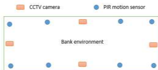
Fig 1. Placing of CCTV and PIR sensors

Assume private areas are deployed densely enough with sensors so that a movement through the sensor field triggers multiple sensors. The limitation of the system is that it is designed for monitoring at times when the floor is sparsely populated, such as at night. Also presumed that the sensor nodes know their position in terms of a two-dimensional frame of reference. [3]