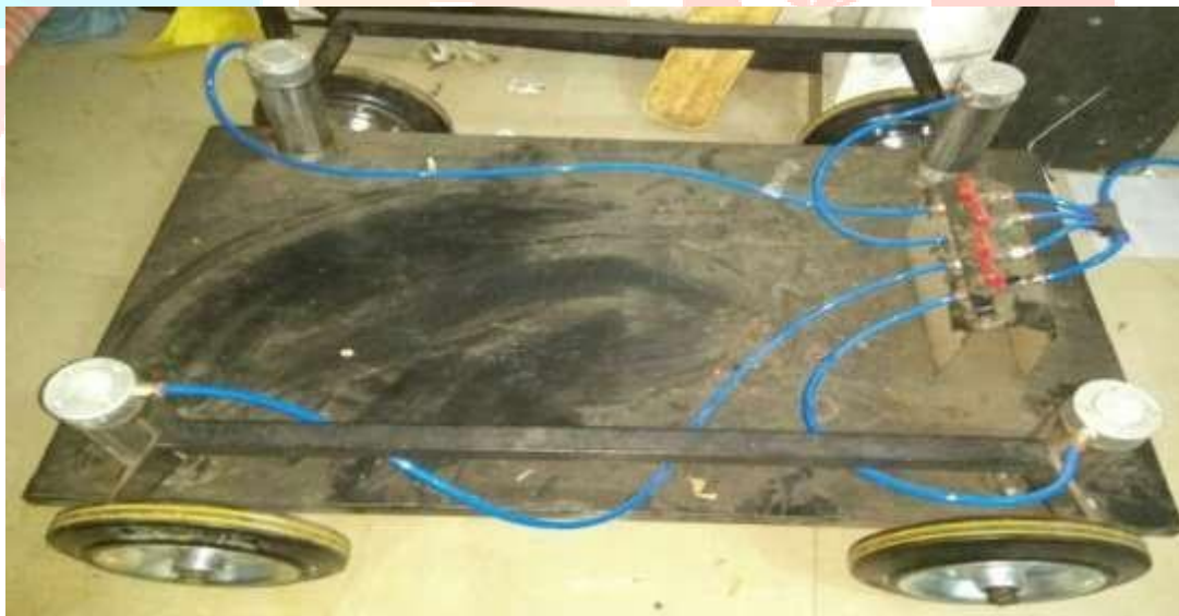
Fig no 4.1: fabricated model