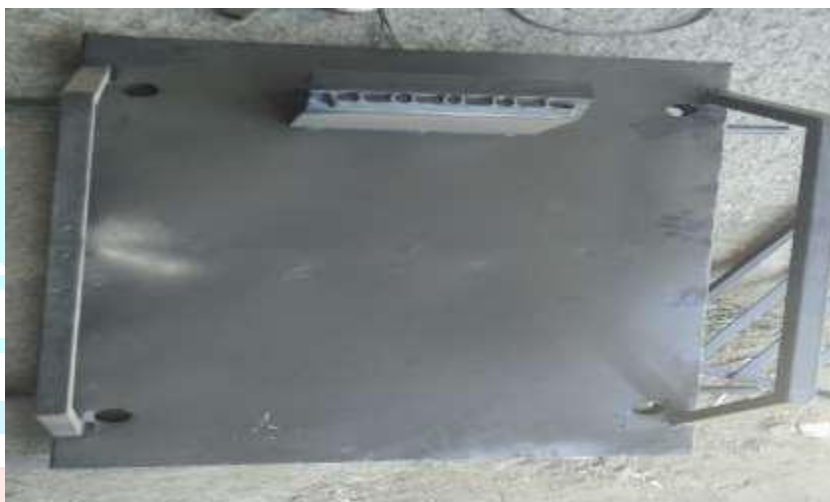
Fig 3.1 . Frame

It is used for support for the setup. Sheet metal is used for the chassis.