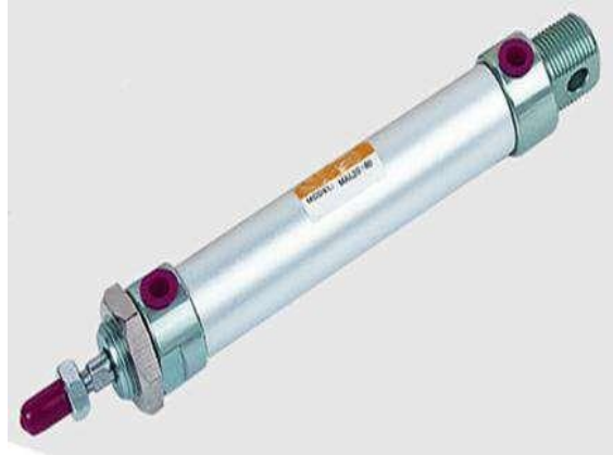
Fig 3.1.4: pneumatic cylinder

The piston is a cylindrical member of certain length which reciprocates inside the cylinder.