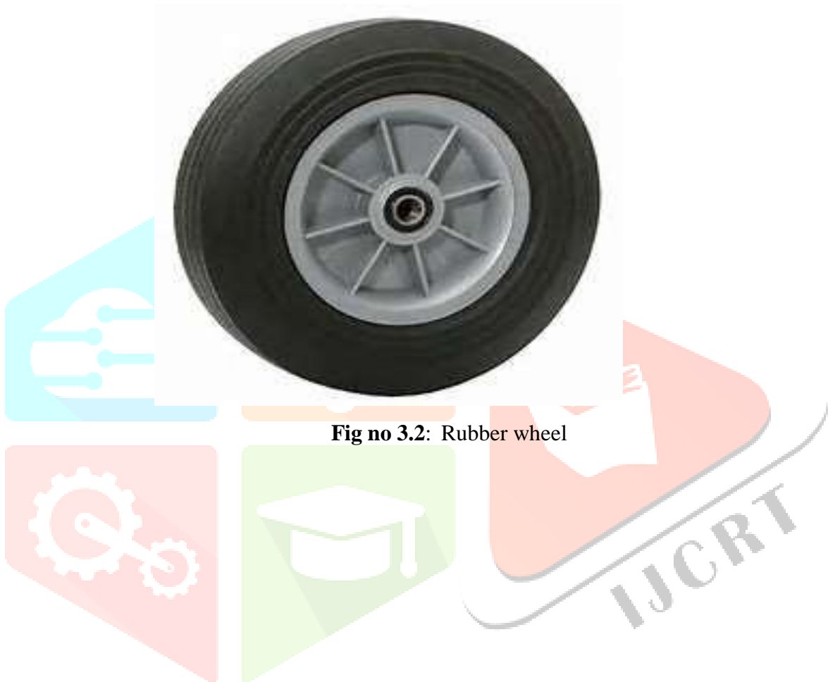
Fig no 3.2: Rubber wheel

It is used for the moving of prototype. The layout of wheel are used for rubber wheel.