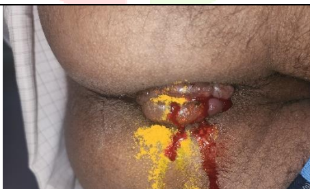
2 nd day after Jalaukavacharana