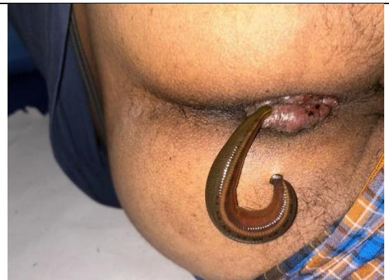
8 th day During Jalaukavacharana