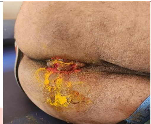
4 th day During Jalaukavacharana