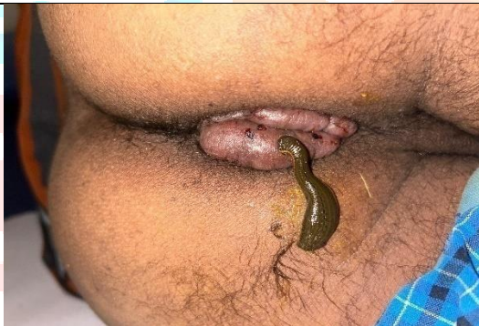
5 th day During Jalaukavacharana