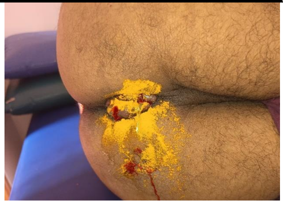
3 rd day During Jalaukavacharana