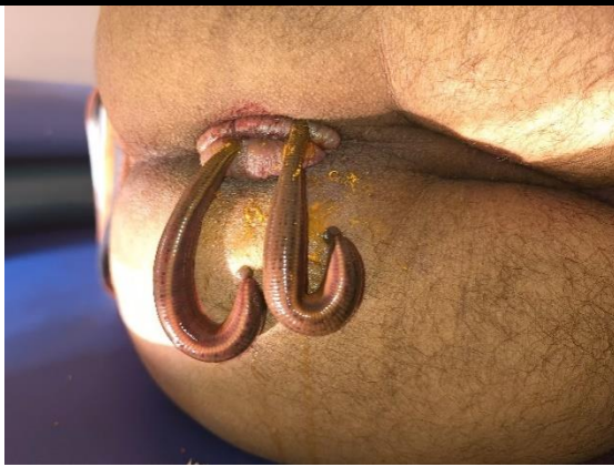
3 rd day During Jalaukavacharana