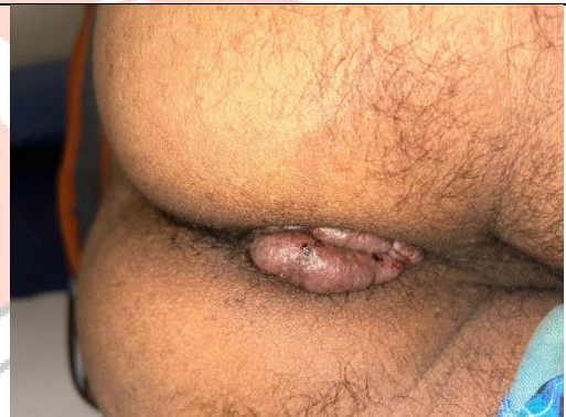
5 th day During Jalaukavacharana