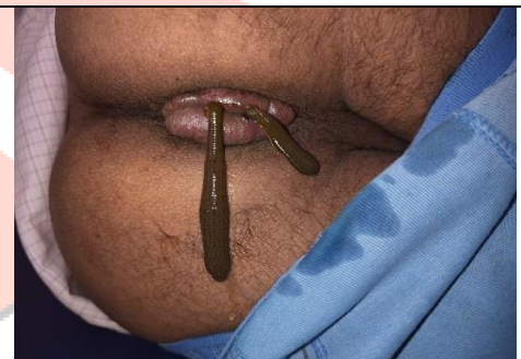
2 nd day During Jalaukavacharana