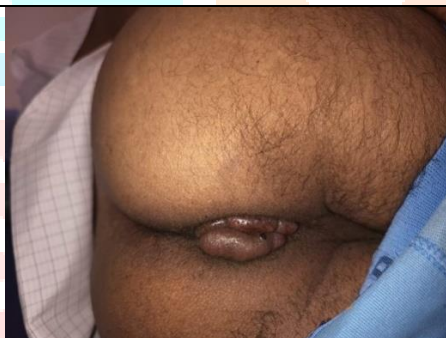
2 nd day Before Jalaukavacharana