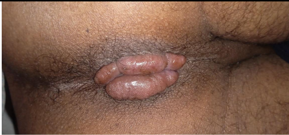
On the day of Admission