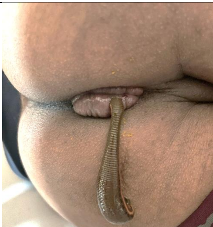
7 th day During Jalaukavacharana