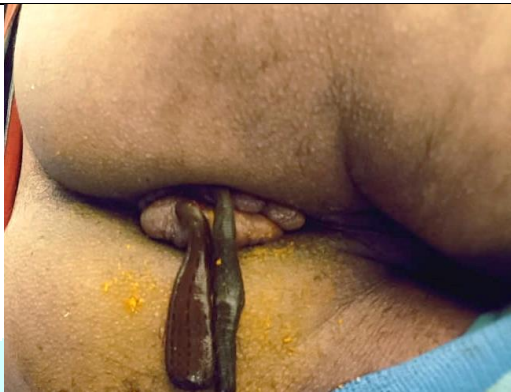
4 th day During Jalaukavacharana