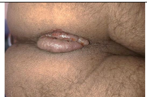
3 rd day Before Jalaukavacharana