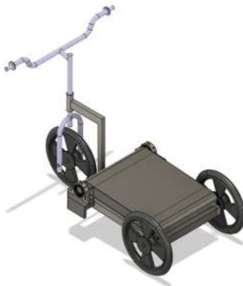
Figure 8 – Assembled Treadmill Bicycle