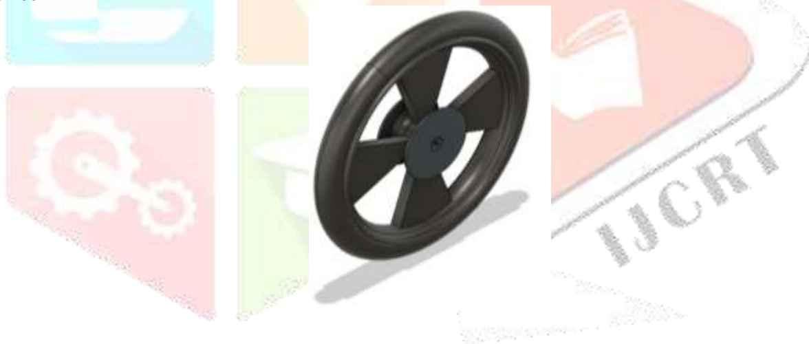
Figure 6 – Wheel

Wheels play a crucial role in the Treadmill Bicycle, making it easy to move around and steer. Both the front and rear wheels are chosen for smooth movement on different surfaces, ensuring a comfortable experience for users. The front wheel allows for steering, making it simple to control the direction with stability. Meanwhile, the rear wheels support the weight of the Treadmill Bicycle and help keep it aligned during use. With wheels included, the Treadmill Bicycle becomes a versatile fitness option that can be easily transported and used in various places like homes, gyms, or outdoors, adding convenience and accessibility to its appeal as a portable fitness device.