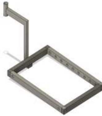
Figure 3 – Main Frame

The main part of the Treadmill Bicycle is made from mild steel and is very important for how it works. It's built with materials that are strong but not too heavy, so it can handle all the moving around while also keeping users safe and comfortable. We use strong steel to make sure it's tough enough for walking and running, but still easy for people to use. Apart from holding everything together, like the handlebars and the treadmill belt, the frame is also made carefully to make sure it's safe and lasts a long time. We use special techniques to join everything together properly, like welding or bonding, to make sure it's all secure.