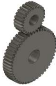
Figure 7 – Gear

In this setup, the energy from the user's movement is transferred to the treadmill's roller through gears. There's a big gear on the bicycle wheel shaft and a smaller one on the treadmill roller. With a gear ratio of 4:1, for every turn of the big gear, the small one turns four times, speeding up the treadmill belt. As users walk, this gear system translates their effort into movement, providing a thorough cardiovascular workout. This efficient mechanism ensures a smooth exercise experience, helping users reach their fitness goals effectively.