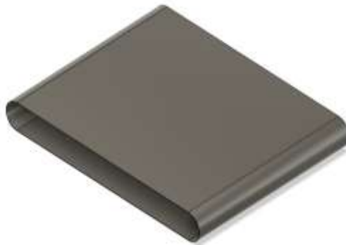
Figure 4 – Conveyor Belt

The conveyor belt in the Treadmill Bicycle is made of rubber and plays a key role in turning the movement from walking/running into forward motion. It's designed to feel like jogging or running outdoors and can handle the impact of your feet as you walk or run. The belt is strong and lasts a long time, giving you a smooth and consistent workout experience. By using the conveyor belt, the Treadmill Bicycle not only improves your heart health but also lets you do different types of exercises for a full-body workout.