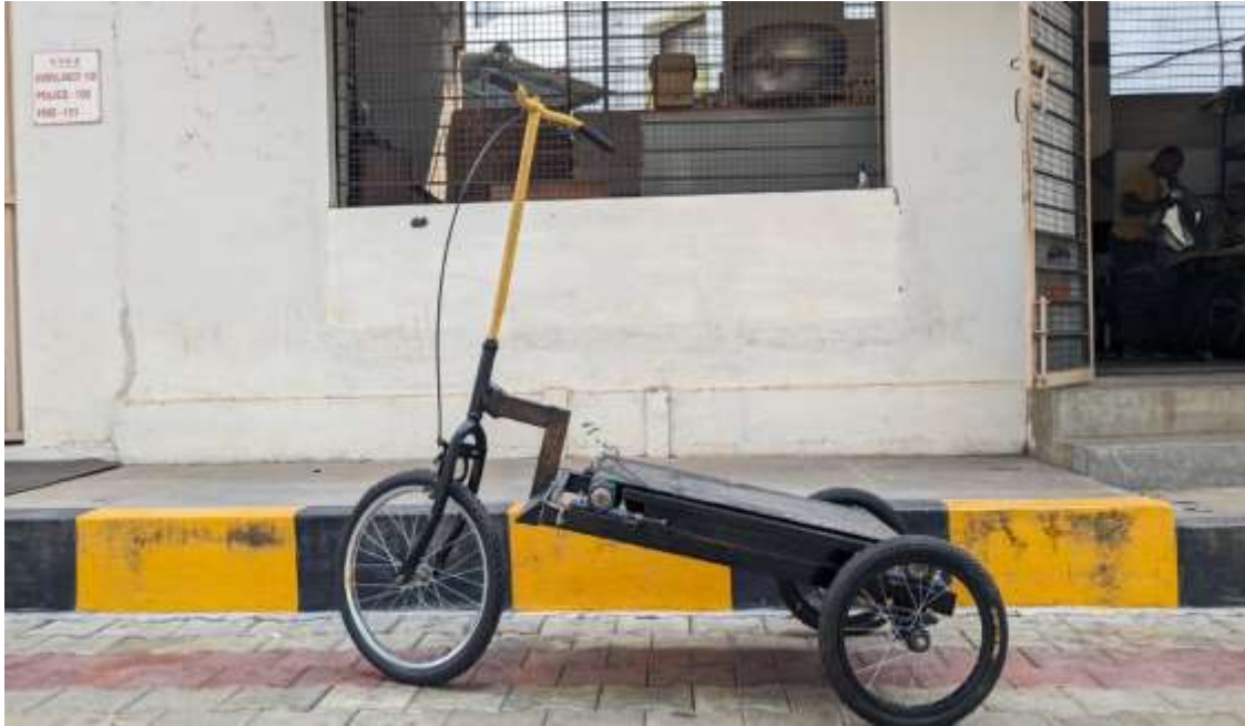
Figure 9 – Fabricated Model