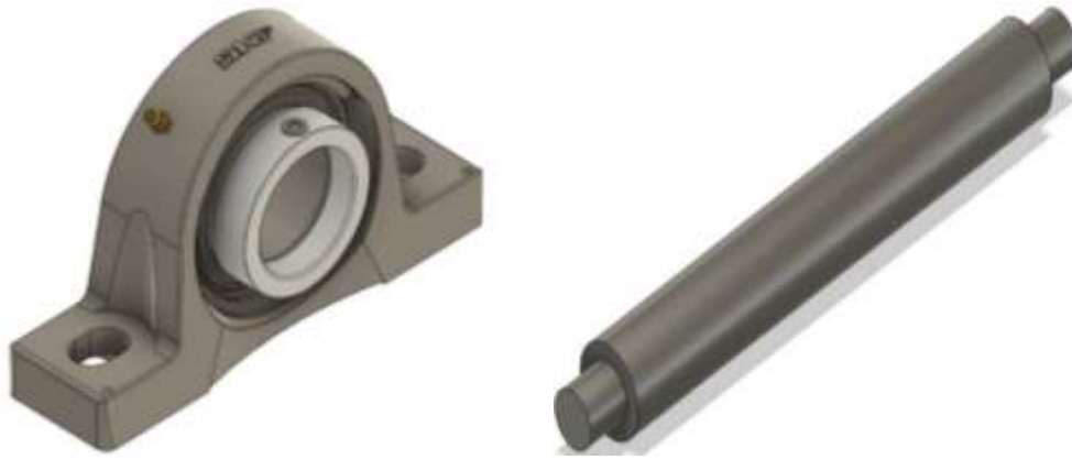
Figure 5 – Rollers and Pillow Block

In the Treadmill Bicycle, the collaboration between Rollers and Pillow Block is crucial for smooth operation. Rollers, placed along the conveyor belt, help it move smoothly while Pillow Blocks reduce friction, ensuring efficient energy transfer. These Pillow Blocks also reduce resistance, making walking feel more natural and preventing damage to the system. Together, they create a smooth experience for users, making walking or running on the treadmill comfortable and efficient. This teamwork between Rollers and Pillow Blocks not only improves the user's workout but also makes the Treadmill Bicycle more durable and efficient.