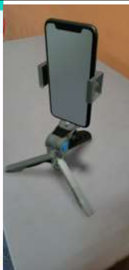
Figure (B): Product Details