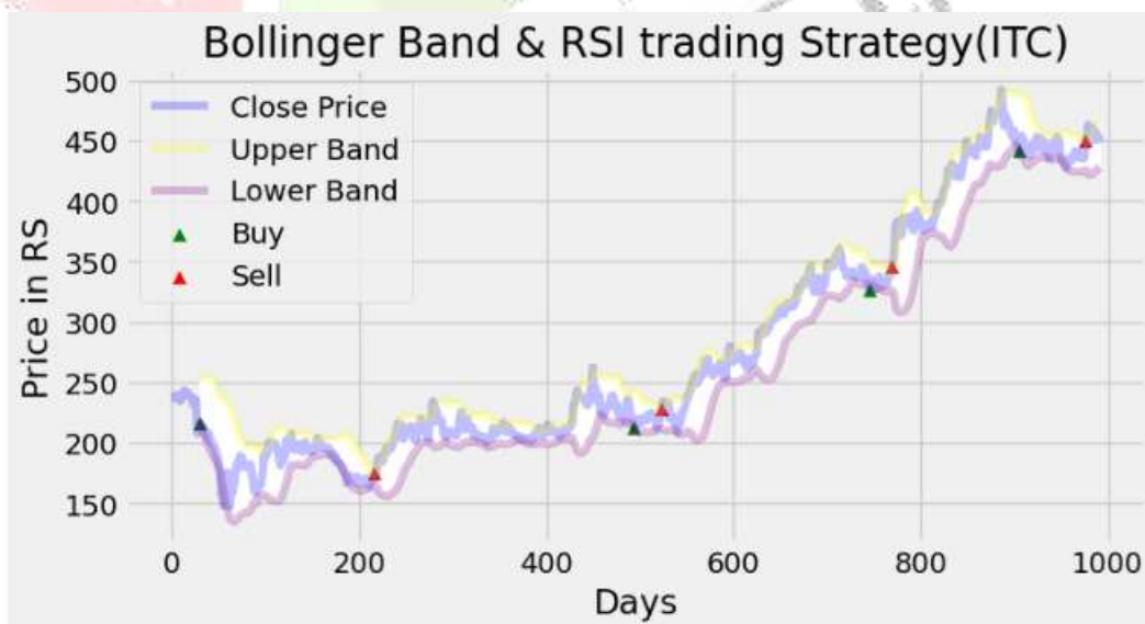
Fig.3.Bollinger Band & RSI trading Strategy of ITC

The dataset used in this research consists of historical stock price data for multiple assets traded on the NSE from 26-12-2019 to 26-12-2023. The data is sourced from reputable financial data providers, ensuring accuracy and reliability. Financial institutions, stock brokers, and large-scale investors must sell and buy the shares in the shortest time feasible under the law. By effectively capturing the nonlinear behaviour of complex systems, recent breakthroughs in Machine Learning approaches have created valuable tools for anticipating chaotic circumstances such as the stock market. In fig 3 & 4 shows Buy and Sell signals in various time period with the help of Bollinger band RSI indicator.