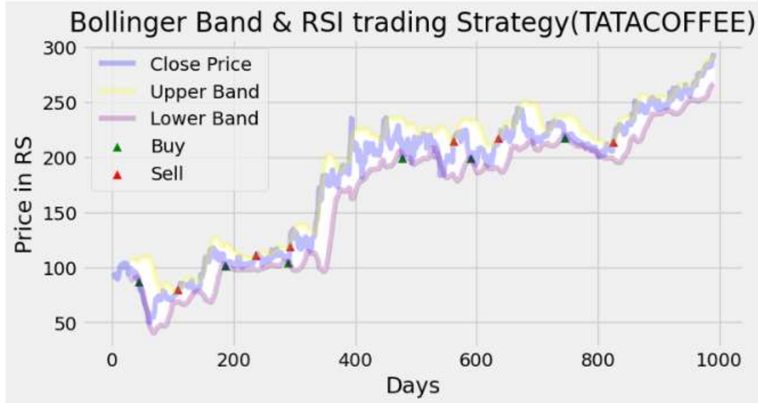
Fig.4.Bollinger Band &amp; RSI trading Strategy of TATACOFFEE