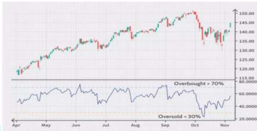
Fig.2 Example of RSI in the trends

The RSI can be plotted beneath the price chart of an asset once it has been calculated, as demonstrated below. The more and larger the number of up days, the higher the RSI will be. As the amount and magnitude of down days rise, it will decrease. Fig. 2 shows RSI Indicator to indicate Overbought and Oversold of the stock.