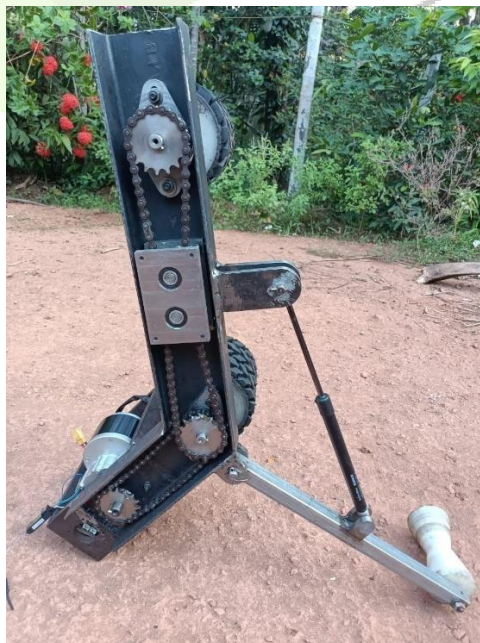
Fig 2 Robot prototype

The robot is equipped with a 24V LiPo battery that powers the motor used to drive the system. A Cytron Smart Drive MDDS30 Dual 30A motor driver is used to control the operation of the motor[5]. The wheels of the robot are rotated with the help of a gearbox and a chain drive. The gearbox aids in reducing the speed of the motor and converting the high-speed rotation into low-speed torque, which is required for the efficient rotation of the wheels. One of the wheels rotates clockwise, while the other rotates counter clockwise[6]. This allows the robot to move smoothly and maintain balance when moving up and down the tree. To provide additional stability, a third support wheel is integrated into the robot design. This support wheel helps to securely attach the robot to the arecanut tree while it is in operation. The wheel is positioned in such a way that it does not hinder the movement of the robot on the tree. The final designed robot is shown in Fig 2.