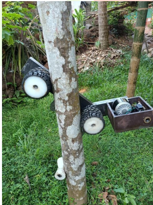
Fig 4 Testing of designed robot

The robot described in this study was successfully able to climb the arecanut tree and spray the pesticide as per the controller's instructions as shown in Fig 4 and 5. The operator controls the movement of the robot using a transmitter-receiver system. Once the robot has reached the desired location on the tree, the pesticide solution is sprayed onto the arecanuts through a nozzle attached to the robot's frame. A pump delivers the correct amount of pesticide solution to the nozzle, ensuring that the arecanuts receive the appropriate amount of pesticide solution.