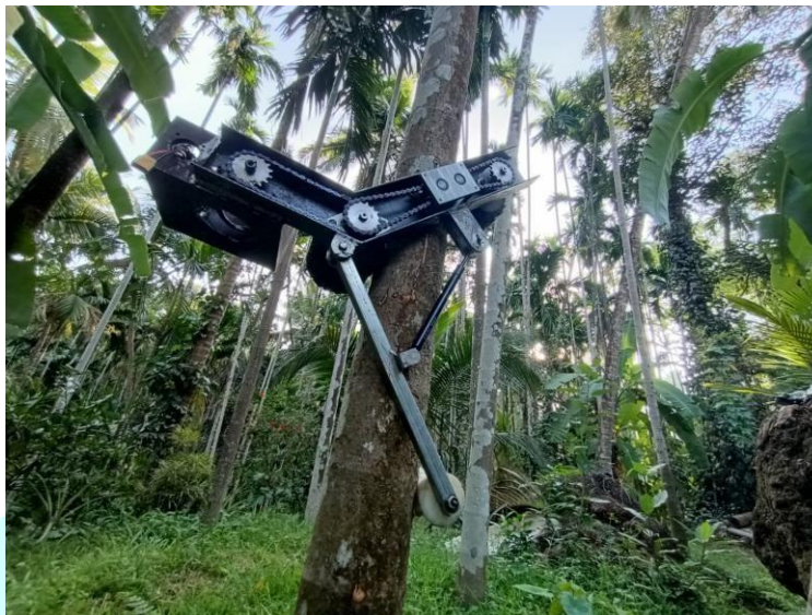
Fig 5 Pesticide spraying robot in action

The successful performance of the robot has several significant implications. Firstly, it eliminates the need for human labour to climb trees and spray pesticides manually, thereby reducing labour costs and the risk of accidents. Finally, the use of the robot ensures that the pesticide is applied in a timely and efficient manner, leading to better pest control and improved yield of the crop. Overall, the results of this study demonstrate that the use of this robot for pesticide spraying in arecanut cultivation is a viable and effective solution that has significant potential to improve the efficiency and sustainability of crop production.