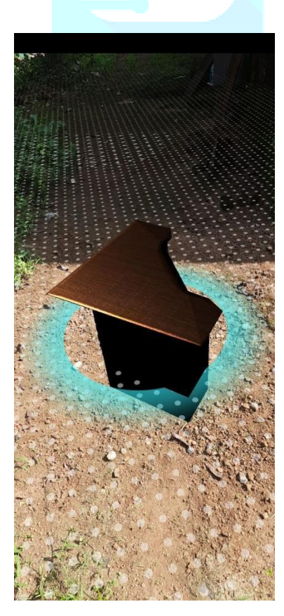
Fig.5.2. The product is spawned at the location of marker on touch