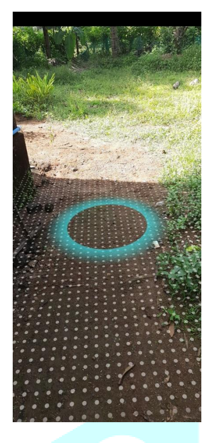
Fig.5.1. Augmented Plane Detection starts as soon as the view is loaded