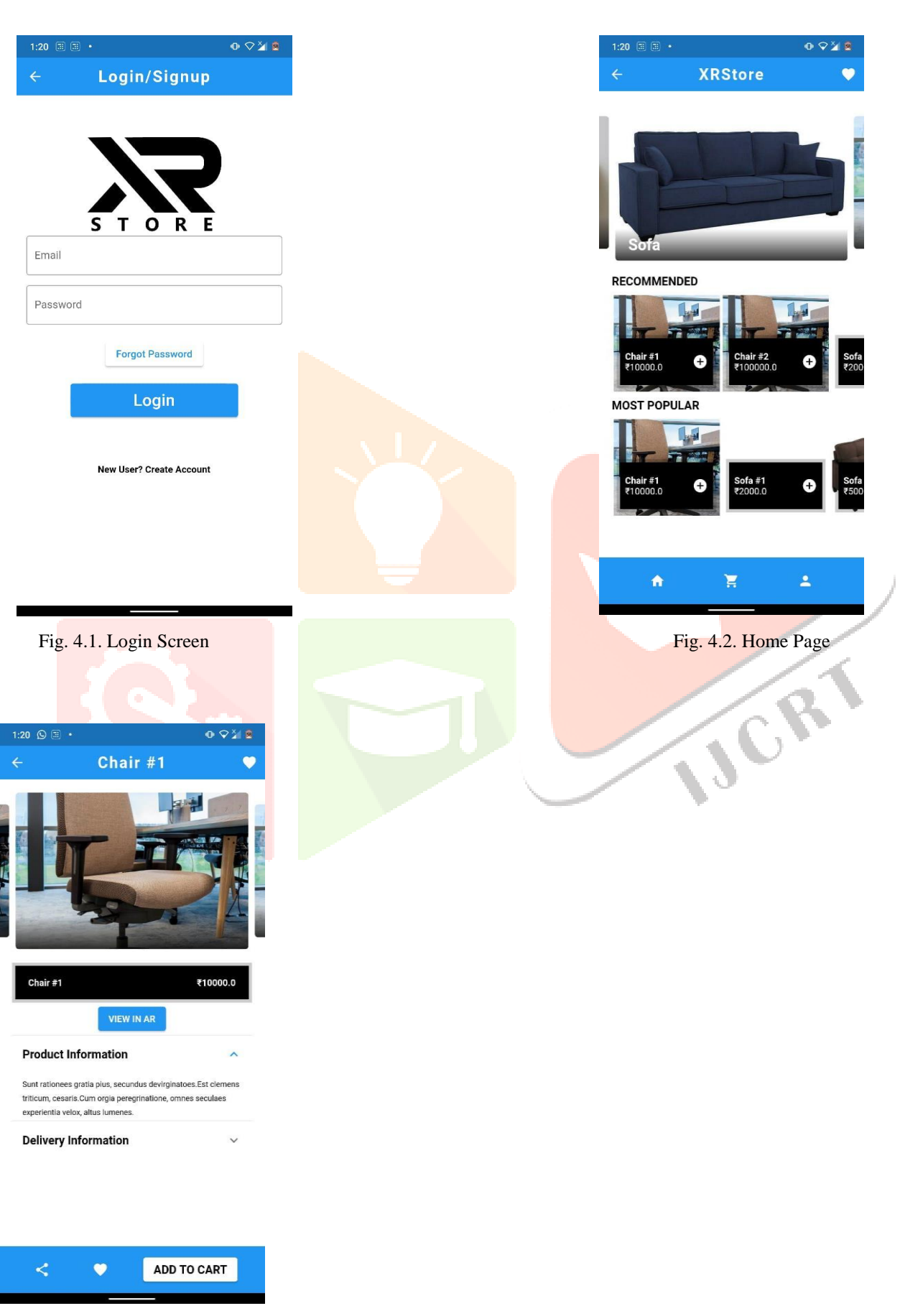
Fig. 4.3. Product Description

The primary purpose of this software is to allow customers to visualize how the products which they want to purchase will appear before purchasing it.