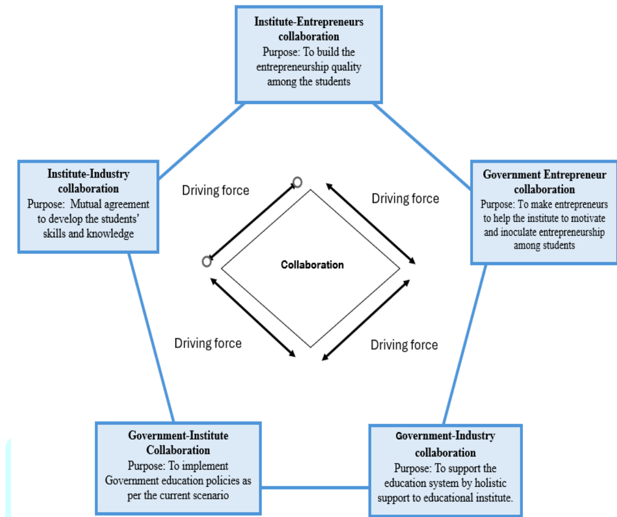
Model No 1: Collaboration Model

Collaboration model highlights the collaborative ecosystem required for promoting entrepreneurship and skill development among students in higher education institutions. The model identifies 2 major categories of stakeholders— Institute with Industry and Entrepreneurs (Institutes initiatives roles and responsibilities) and Government with Industry and Entrepreneurs (Government initiatives, roles and responsibilities)—all act as driving forces to nurture the students.