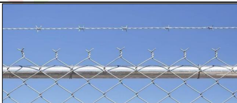
Figure 4. 3: Wire Differences in Chain-Link Fences

Suitable for enclosing lawns, roads, and other areas where a secure yet visible barrier is needed.