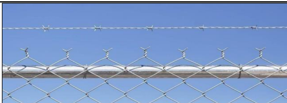
Figure 4. 3: Wire Differences in Chain-Link Fences

When considering chain link fencing, several types of wires can be used, each with its unique properties and applications. The most popular types are heavy galvanized wires, vinyl-coated wires, green PVC wires, and black PVC wires.