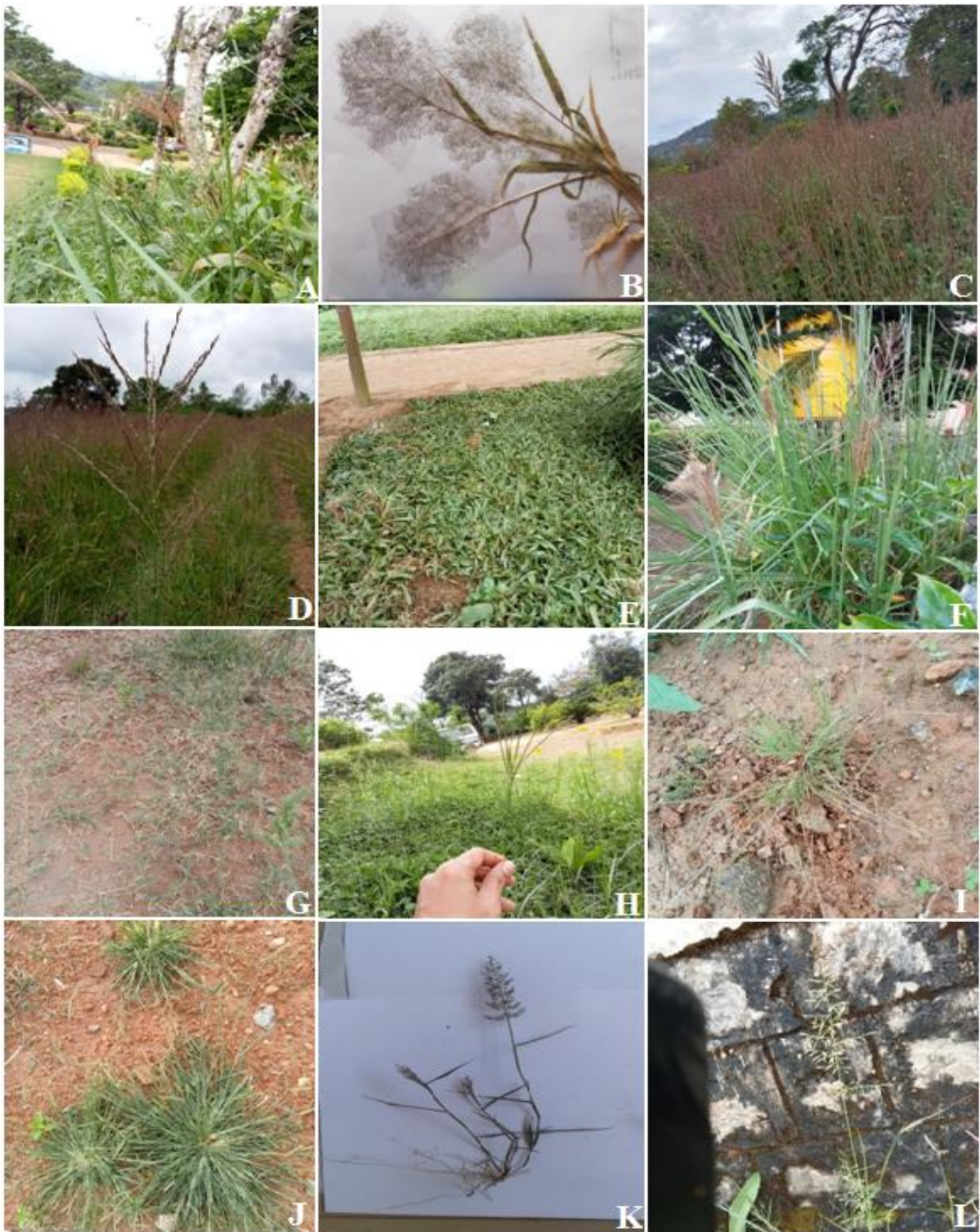
Figure 3: Grasses of F.M.K.M.C. College, Madikeri Taluk, Kodagu.