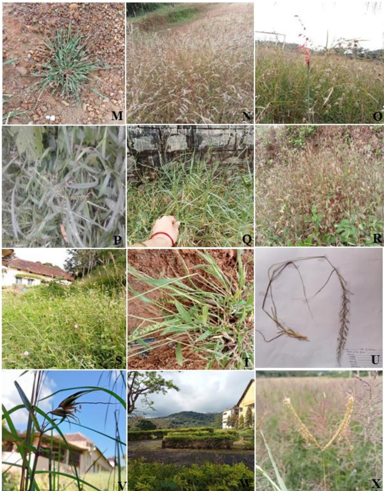
Figure 4: Grasses of F.M.K.M.C. College, Madikeri Taluk, Kodagu.

M. Eragrostis uniloides . N. Heteropogon contortus . O. Melinis repens . P. Oplismenus composites . Q. Panicum psilopodium . R. Pseudanthistiria umbellata . S. Sacciolepis indica . T. Setaria intermedia . U. Sporobolus diander . V. Themeda triandra . W: Unidentified species 1. X: Unidentified species 2.