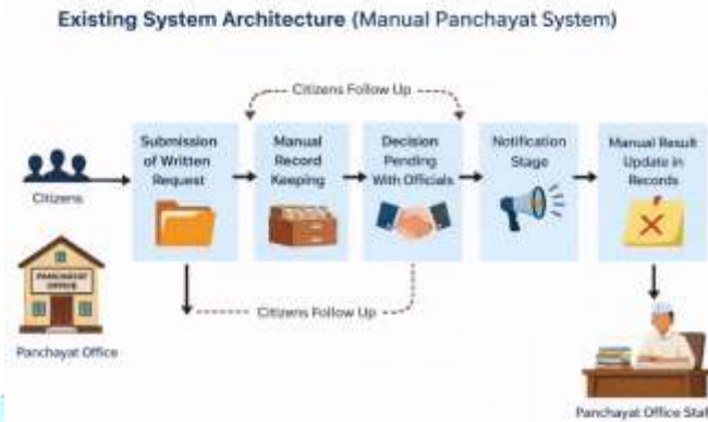
Fig. 1. system architecture of smart panchayat system

Overall, the methodology ensures a structured, scalable, and intelligent system capable of handling large volumes of user requests while maintaining high performance and reliability.