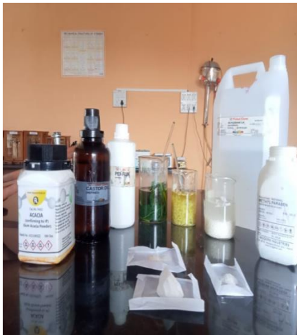
Fig no:7.1 Collection of Ingredients