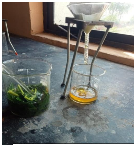
Fig no:7.2 Extraction of papaya leaves