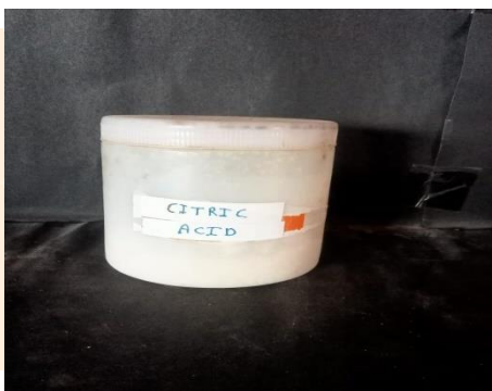
Fig no. 6 Citric acid

Uses : It is used to adjust the pH of shampoo.