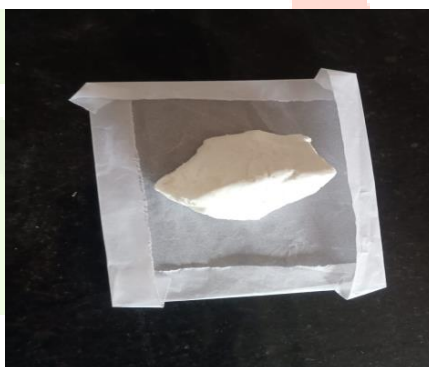
Fig no. 2 Sodium lauryl sulphate

Chemical constituents : Sodium alky sulphates