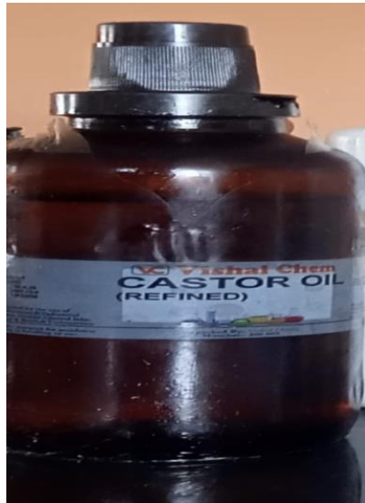
Fig no. 3 Castor oil