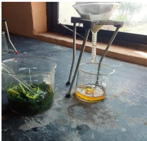
Fig no. 1 papaya leaves extract