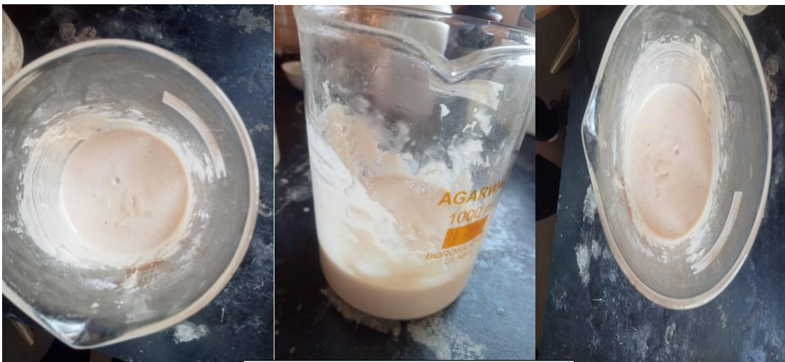
Fig no: 7.3 Preparation of Shampoo