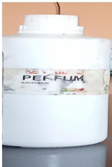
Fig no. 8 Perfume (lavender flavour)

Biological source : lavandula angustifolia