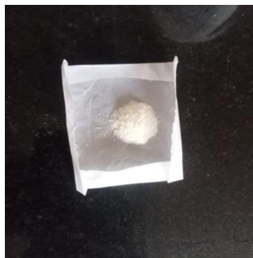
Fig no. 5 Methyl Paraben

Chemical constituents : 4-hydroxybenzoate ester