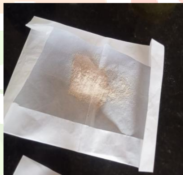
Fig no. 4 Acacia