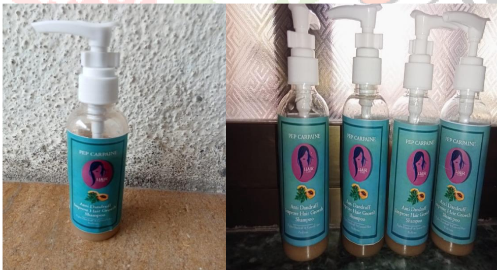
Fig no: 7.4 Filling, Labelling & Packaging of Shampoo