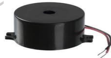
Fig 4.3: Buzzer

[8] Essentially, the sound emanating from a piezoelectric sound component originates from a piezoelectric diaphragm. This diaphragm is composed of a piezoelectric ceramic plate featuring electrodes on both sides and a metal plate (typically brass or stainless steel). The assembly involves attaching the piezoelectric ceramic plate to the metal plate using adhesives. The application of a direct current (D.C.) voltage between the electrodes induces mechanical distortion in the piezoelectric diaphragm, a phenomenon attributed to the piezoelectric effect.