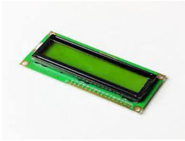
Fig 4.4: LCD Display

[9] The liquid crystal display (LCD) holds significant importance in embedded systems, providing users with substantial flexibility to showcase desired data. The notation "116*2" implies a configuration of 16 characters per line across 2 lines. In the context of vehicle speed detection, this LCD serves as a visual interface where the real-time speed information is presented.