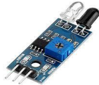
Fig 4.2: IR Sensor

[7] The IR sensor module comprises key components, including the IR Transmitter and Receiver, Opamp, Variable Resistor (Trimmer pot), and an output LED. The IR LED Transmitter emits light within the Infrared frequency range. Notably, infrared light falls outside the visible spectrum for humans, with a wavelength ranging from 700nm to 1mm. This light, while invisible to our eyes, plays a crucial role in the functionality of the IR sensor module. Warren, J. D., Adams, J., Molle, H., Warren, J. D., Adams, J., & Molle, H. (2011). Arduino for robotics (pp. 51-82). Apress.