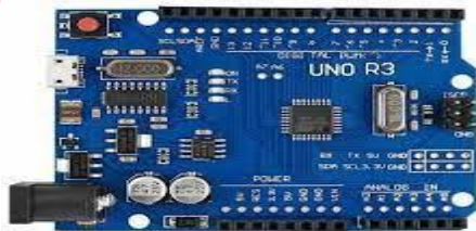
Fig 4.1: Arduino

[6] Arduino stands out as a widely adopted physical computing platform and an interactive development environment. Functioning independently, it engages with the Arduino software installed on a computer. This software incorporates the Arduino Integrated Development Environment (IDE), which serves as the programming interface. While Arduino offers various development boards, the Arduino Uno is particularly prevalent despite not being the inaugural option on the market. The Arduino Uno is a microcontroller centered around the ATmega328p. It encompasses essential