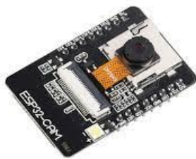
Fig 4.5: ESP32 Camera

[10] The ESP32-CAM stands out as a compact, energy-efficient camera module built on the ESP32 platform. Featuring an OV2640 camera and incorporating a built-in TF card slot, it offers a versatile solution for various intelligent Internet of Things (IoT) applications. Its applications span a range of uses, including wireless video monitoring, WiFi image uploading, QR identification, and more.