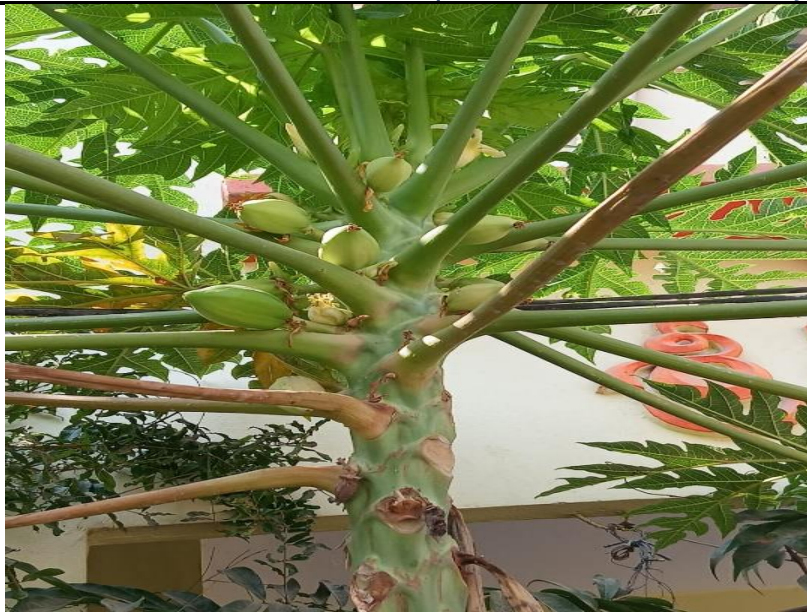
Figure B: after giving calcarea phos