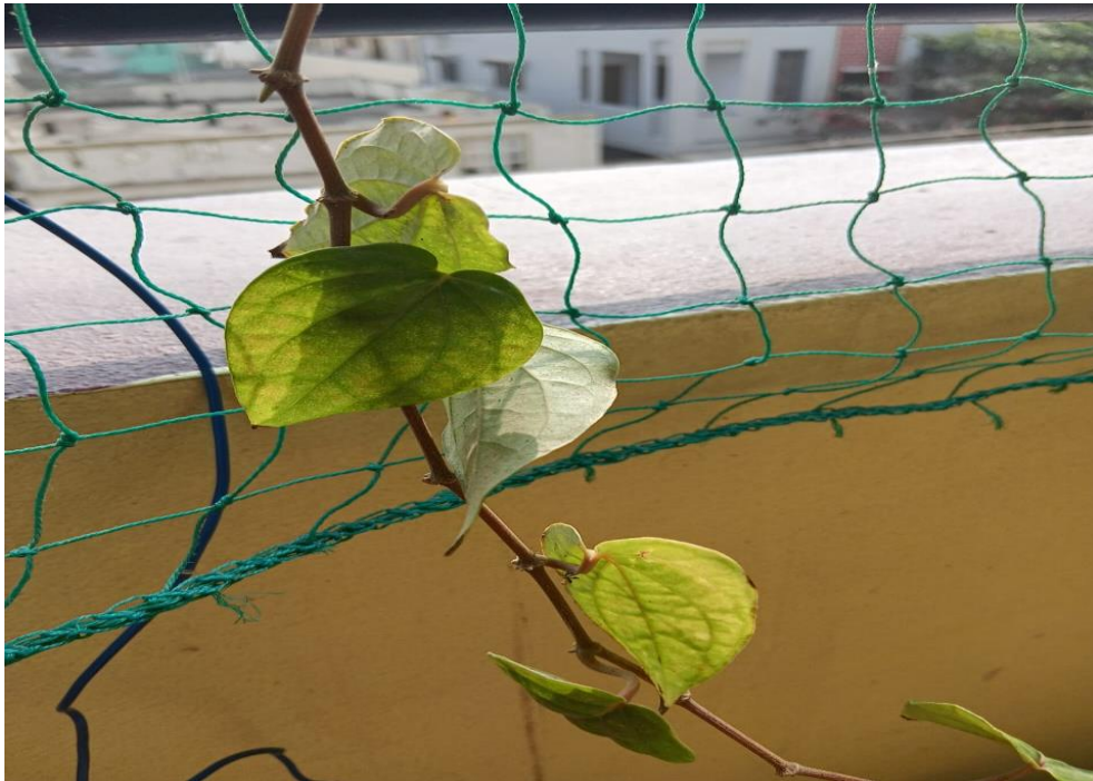
FIGURE B: After giving coccus cacti