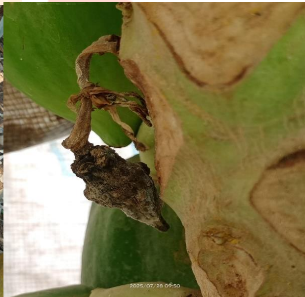
fruits became dry and black