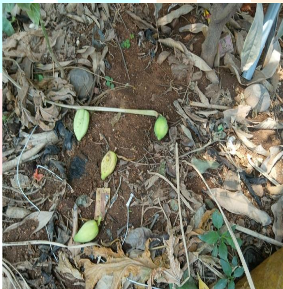
Fruits that fell early