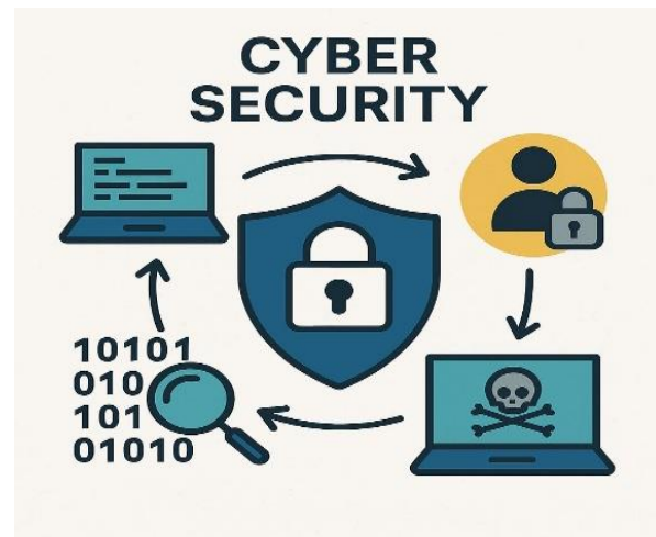
Fig. 2. Cyber Security Components and Interconnection