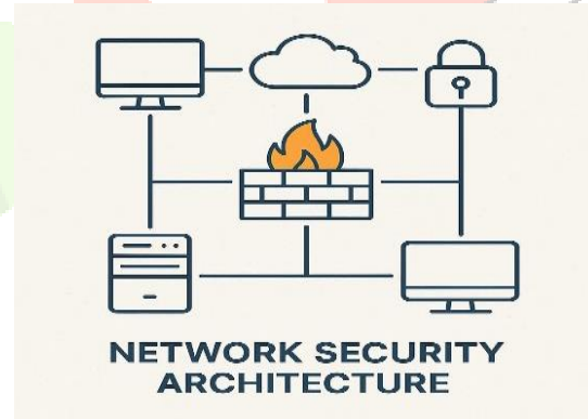
Fig. 3. Network Security Architecture with Firewall and Components

These systems monitor network traffic and recognize suspicious activity[13].