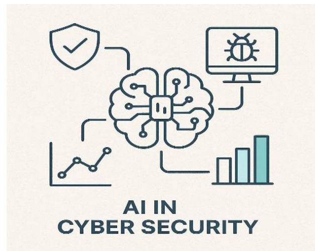
Fig. 5. Role of AI in Cyber Security Threat Detection

AI[13] is used to identify anomalies in network behavior and to automate threat detection.