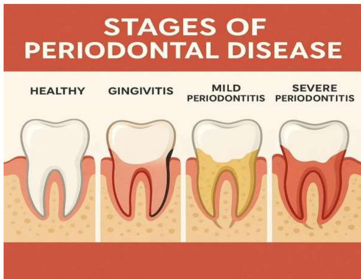
Fig no 1.1:- periodontal disease