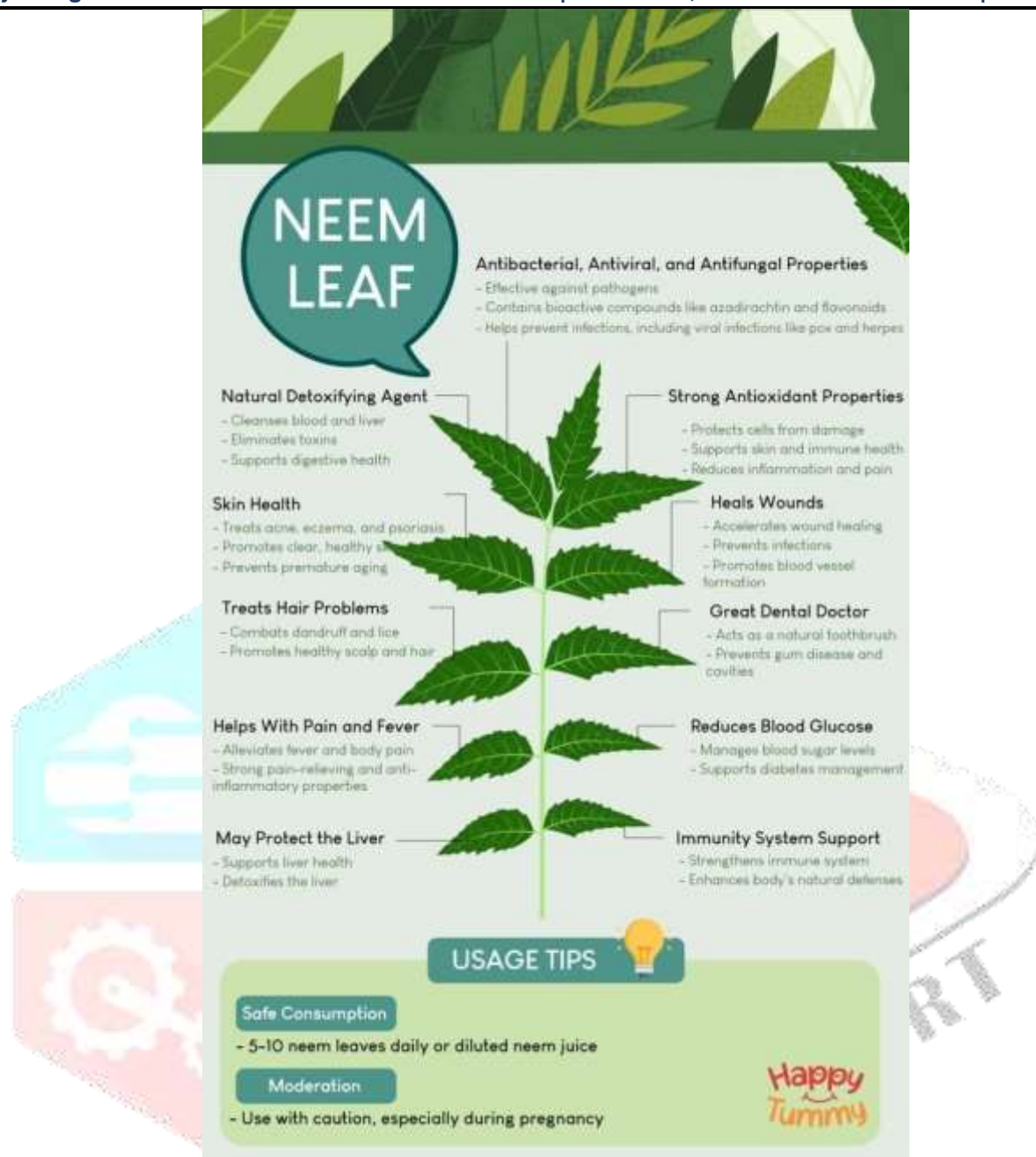
FIG 1.3:- Benefits of neem