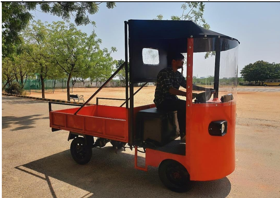
Fig 4.1 Final Image of Electric vehicle