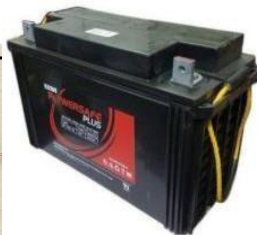
Figure 3.1 Motor and Battery used in the vehicle

The development of the hydraulic lift and trolley system for an electric vehicle (EV) involved a systematic approach that began with the identification of the operational requirements. Initial design specifications were established based on the vehicle's weight, intended lifting height, safety factors, and maneuverability. CAD modeling software was used to design the lift structure and trolley frame, ensuring proper load distribution and structural integrity. Finite Element Analysis (FEA) was conducted to validate the design under simulated load conditions. Based on the analysis, modifications were incorporated into the prototype design before moving to the fabrication stage. The fabrication process utilized mild steel (MS) for the trolley frame and lift arms due to its high strength, ease of machining, and cost-effectiveness. The hydraulic system was composed of a manual hydraulic jack, pressure lines, and valves capable of lifting loads up to 1.5 tons. Welding, cutting, and drilling were carried out using precision tools to ensure dimensional accuracy and robustness of the structure. All joints were reinforced using gussets and support plates to prevent structural failure during operation.