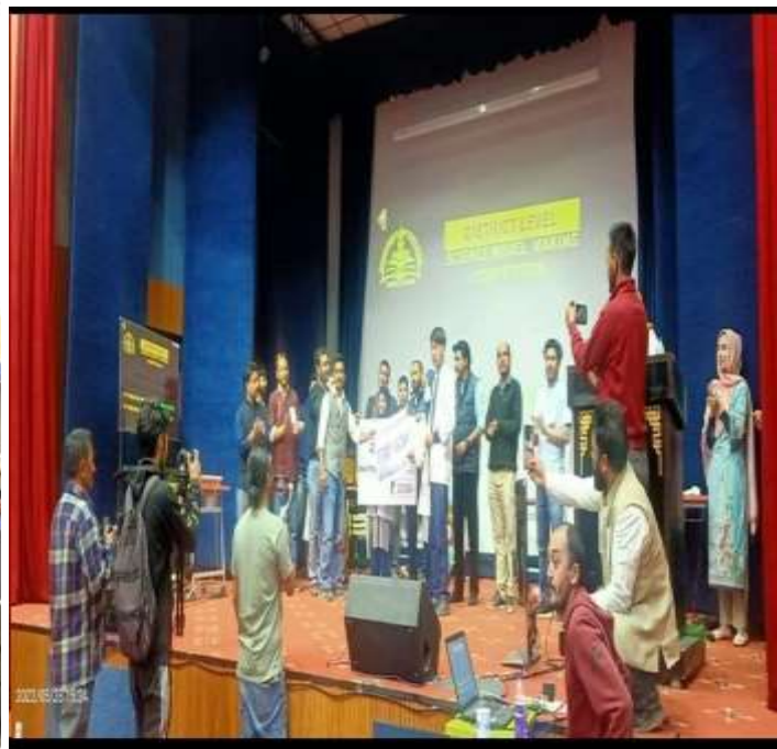
Figure 3. 1 st position at District level in science exhibition 2023 District in science exhibition 2022