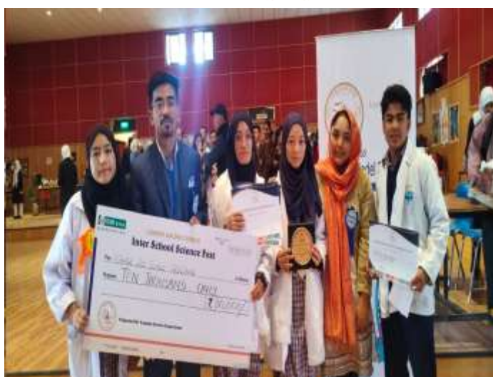
Figure 1. 2 nd position at State level in science model exhibition 2023 National Level 2023

Our school has placed first position four times in this science creativity model competition, and our students have position holder at the zonal, district, UT, and national levels as a result of adopting the best teaching practices that foster students' critical thinking and creativity additionally, following the application of the best learner-centric demonstration cum activities base teaching methodology, over 25 students were selected in the NEET and JEE exams. Two students named Nawaz Ali, who placed first in the UT Ladakh NEET examination in 2022, and Zulfikar Ali, who placed first in the JEE exam in 2023, did so as a result of the effect of using the best teaching practices. Furthermore, it enhanced the quantity of students enrolled in upper secondary education programs. As a result of this learner-centered approach that involves many students in the process, teachers are not as burdened and students are able to create over 100 functional models on their own. This method also fosters creativity and encourages discussion, both of which improve interpersonal communication skills.