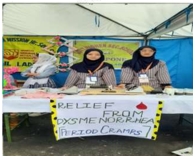
Figure 2. 1 st position at