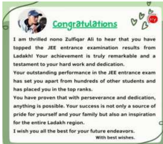
Figure 8. 1 st position in JEE UT Ladakh