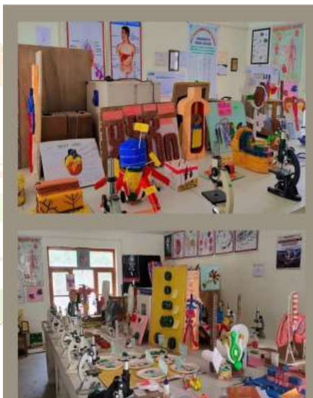
figure10. Effective Demonstration Model that encourages learning

Our school's activities are impacted by the new knowledge that both teachers and students are gaining, as well as by the effective demonstration model and activity-based approach to instruction. Our performance and other activities have been impacted by the last three years of teaching. We saw the impact of that on the activities at our school, and parents and the school development community are ecstatic about their children's improvements and selections in multiple competitive exams.