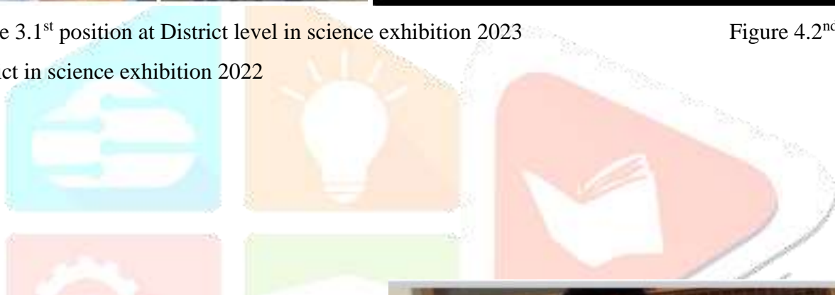
Figure 4. 2 nd position at