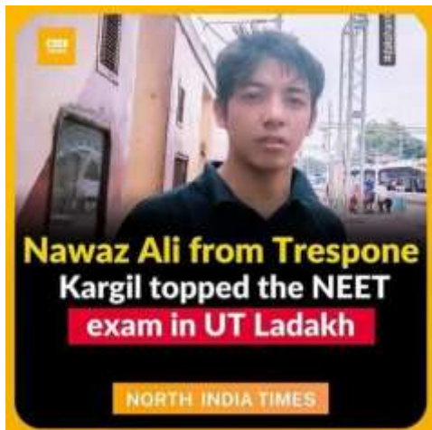
Figure 7. 1 st position in NEET UT Ladakh