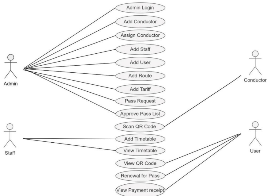
Fig.2.Use Case diagram