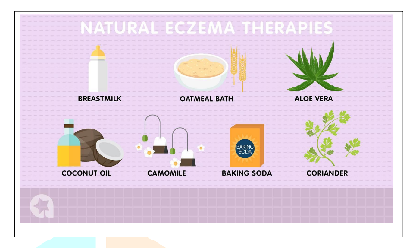
Fig. 9 Household Remedies in Eczema

To try an apple cider vinegar bath soak: