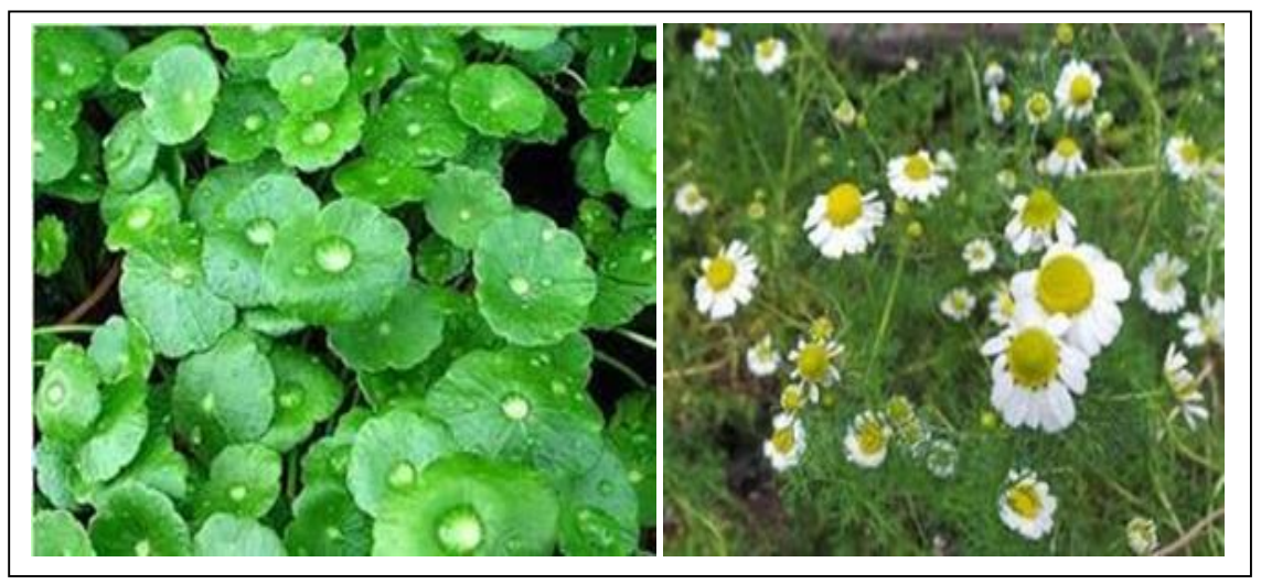
Fig. 7 Baboona and Brahmi used in Treatment of Eczema

Therapeutic use of chamomile is common in conditions like cancer, cardiovascular disorders, common cold, gastrointestinal problems and sleep disorders. It has also been reported to have positive effects on wound healing and skin inflammatory conditions and is therefore widely utilized in skin allergic conditions e.g. atopic dermatitis and eczema. It is also used topically as ointment or cream [38]. In a clinical trial conducted on 161 patients of eczema wherein, topical chamomile extract formulation was applied on affected skin. The study showed equal affects in comparison to steroidal cream whereas effects were found superior to that of non-steroidal cream [39]. Dosage is 5 gms of dried flower [40].