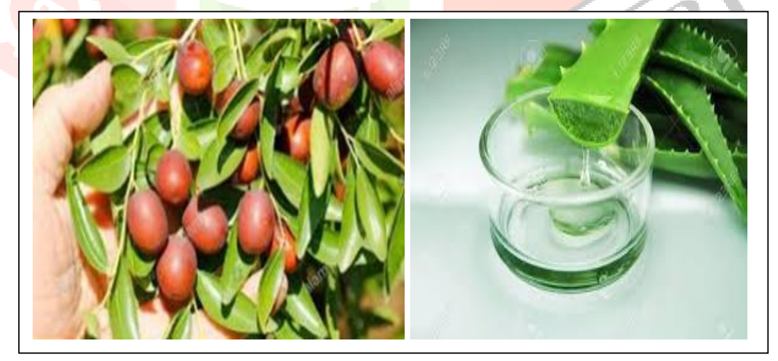
Fig. 6 Aloe-vera & Unnab used in treatment of Eczema

Commonly prescribe in patients with stress by traditional healers [30]. It is reported to have antibacterial, anti-fungal, anti-inflammatory [31], anti-oxidant and wound healing properties [32]. It is used as a remedy for eczema. Long-term use improves complexion. Dosage is 20 to 25 gms of dried fruit pulp devoid of seed [33].