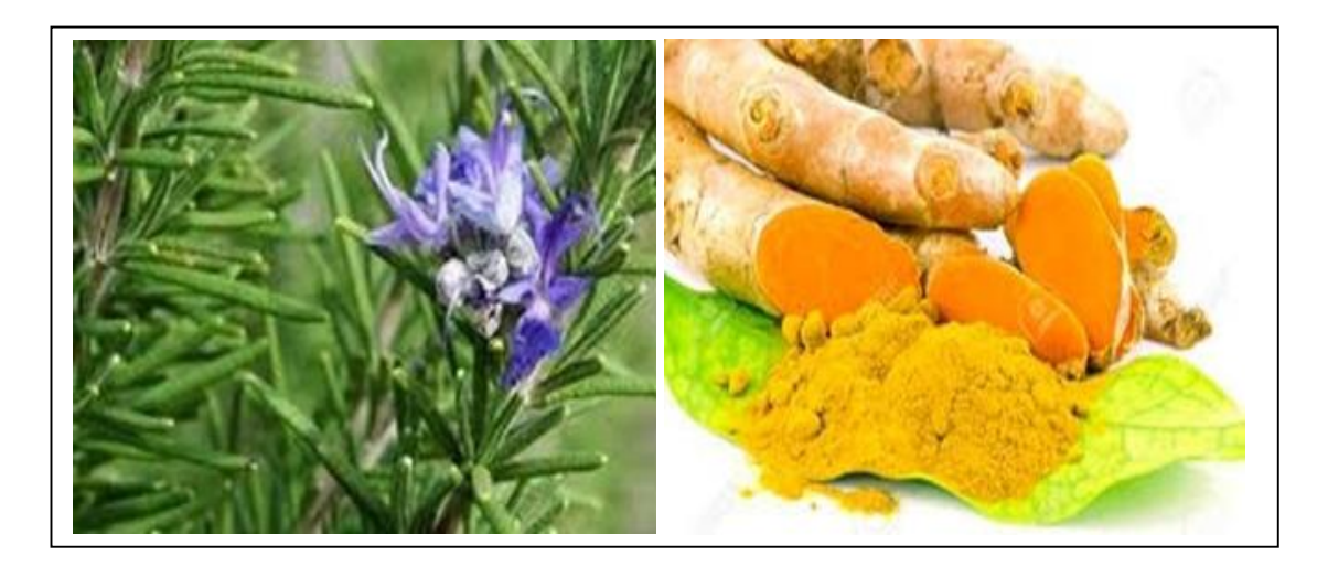
Fig. 7 Iklyl aljabal and Turmeric used in Eczema

Rosemary consumed for boosting memory and also used in eczema for its anti-oxidant and cleansing effects. It can minimize skin inflammation by improving blood circulation. Volatile oil of this plant possesses camphorated smell which can relieve the stress. It is also added to bathwater or used in massage relieving the scaling of skin in eczema [41]. Dosage is 5 gms of dried whole plant [42].