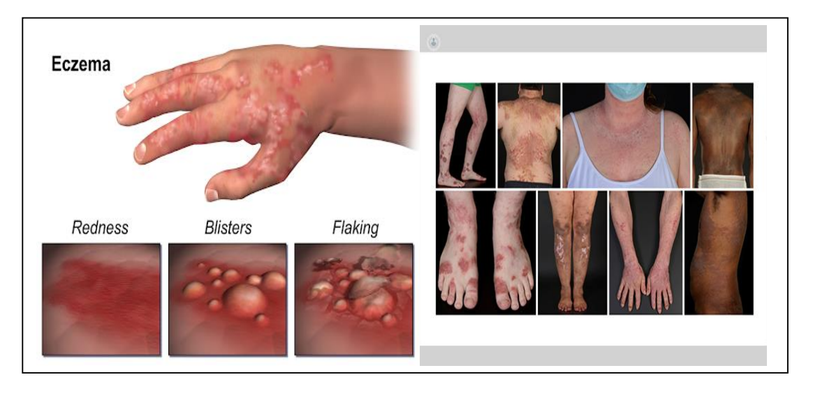
Fig. 2 Redness, Blister, Flaking of Eczema on various parts