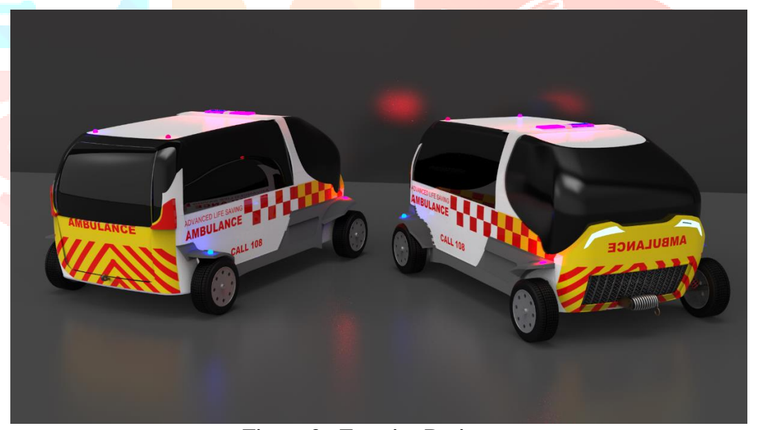
Figure 3: Exterior Design