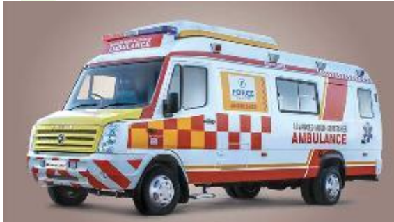
Figure1: Existing ALS Ambulance

VI. The various problems and difficulties faced by the end users of ambulance is generated through primary and secondary research. The access to all the equipment by the technician without moving from the seat is an issue. The technician has to move around in the patient compartment to access to all equipment and medicines as well as the patient. The availability of rear door alone for taking in and out the stretcher is difficult at times. The bulky design of the vehicle makes it difficult in maneuverability in certain conditions. The vehicle can perform on normal road. However, is stuck in other terrains. The lack of mechanicals as well as design limits the vehicle to go through different terrains.