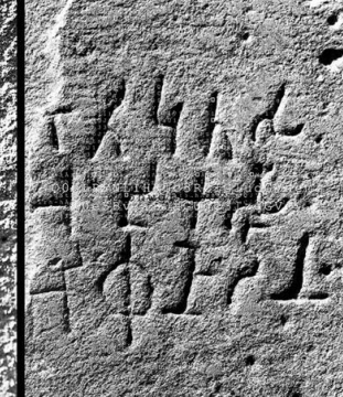
Fig.3, Bombay Shots, 2007-08, digital photomontage archival printed on hahnemuhle fine art pearl paper, edition of 5, 15.5 x 23.5 inches