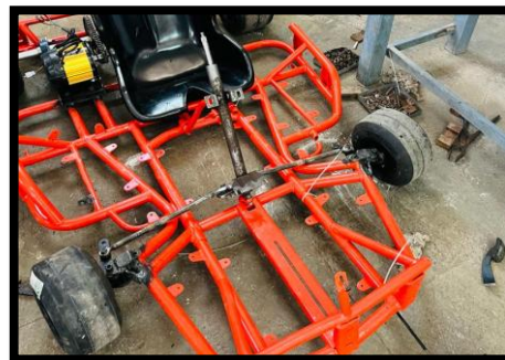
Fig 2. Steering System