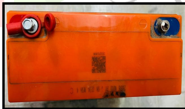
Fig 4 Battery

4. Battery: The most important part of an electric go-kart is the battery. A battery is a power source of the vehicle in which we should consider some parameters such as performance of the vehicle, cost of operation, lifespan of the battery, power requirements of the vehicle, energy density and charging time of the battery. For batteries, lithium or lead-acid batteries are to be considered. The Li-ion Battery is considered to be the top of the traditional lead-acid battery. The specific energy and energy density of each battery are different.