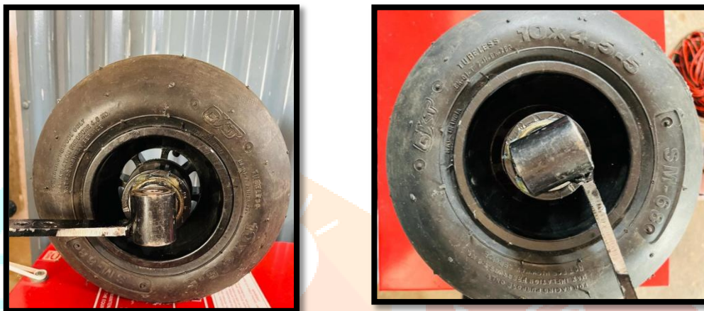
Fig 5. Tyres

8. Knuckle: The steering knuckle is one of the components that make up the automotive steering system. It contains wheel hubs (or spindles) and attaches to the suspension and steering components of a vehicle to transfer the movements of a steering wheel to the front wheels.