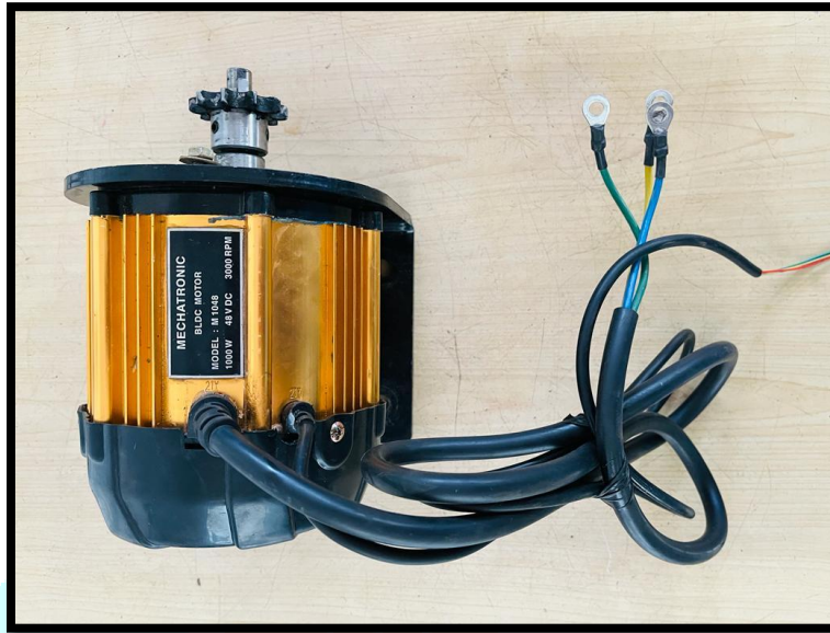
Fig 3. Motor

3. Motor: A motor functions on direct-current electricity. The motors contain permanent magnets rather than electromagnets used in induction motors. The permanent magnet contains less heat loss and energy compared to electromagnets.