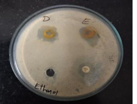
Table5 : screening of antifungal activity of F1, F2 and F3