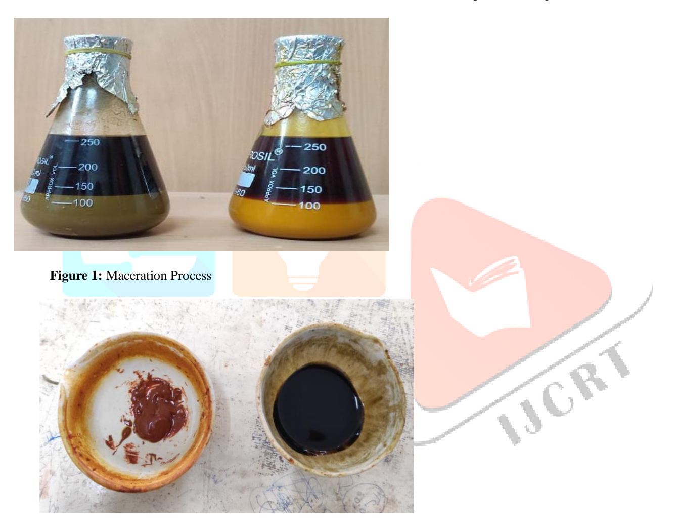
Figure 2: Crude extract of Turmeric and Neem

Dried rhizomes of turmeric were ground and the powder obtained was followed for extraction same as that for neem leaves extract. The extract with crimson red colour was obtained and stored at cool and dark place in air tight container.