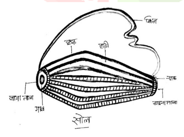
The Khol (A percussion instrument used in Kushan Gaan)

Bain and chorus singers: Dhuti, Genji and Gaamchha.