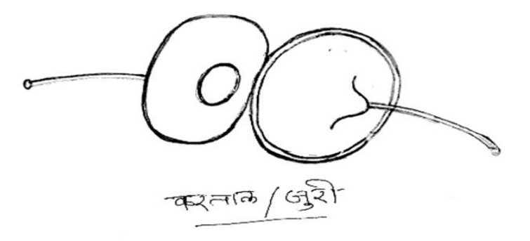
The Kartal / Khapi / Juri ( The solid musical instrument used in Kushan Gaan)

"Das chakro Bhagoban kori nibedan Lokkhoner shoktosel pala kori somapon" Poyaar: any popular folk song with dance and become end.