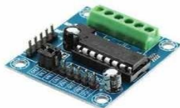
Figure 3.5: Driver circuit

Above image shows the project uses a driver circuit to control the direction of the motors. The driver circuit gets control signals from an esp32 board, which in turn receives orders or instructions from the blynk app. It features input pins for the battery and control unit as well as output pins for the motor connections.