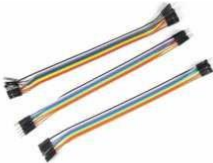
Figure 3.3: Jumper wires