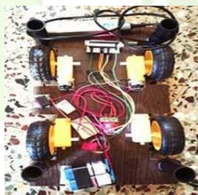
Figure 3.3.1: Prototype of the proposed model Above image shows various components being connected in the module