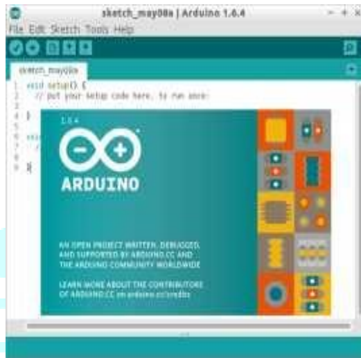
Figure 2 :Aurdio IDE

In this project this IDE is used to write, test and deploy C code to hardware circuit , program written using this IDE are called as sketch, each sketch is written in C or C++, this ide allows to communicate with the circuit boards connected to USB port of the development computer.