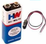
Figure 3.4: External battery

The figure 3.4 Demonstrates the battery with cap, which is used in the suggested project to power BO motors and keep them running. It serves as a source of power for the submercible motor that releases sanitizer. It features a 9v battery.