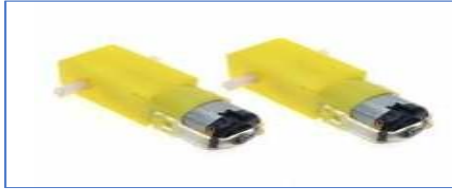
Figure 3.7: BO motors

Figure 3.7 demonstrates pictures of BO motors, which are 100 RPM DC motors that assist the ROBOT model move in the desired directions. They can run on voltages between 3.3 and 9 volts, and the direction of the motors can be changed by switching their polarity.