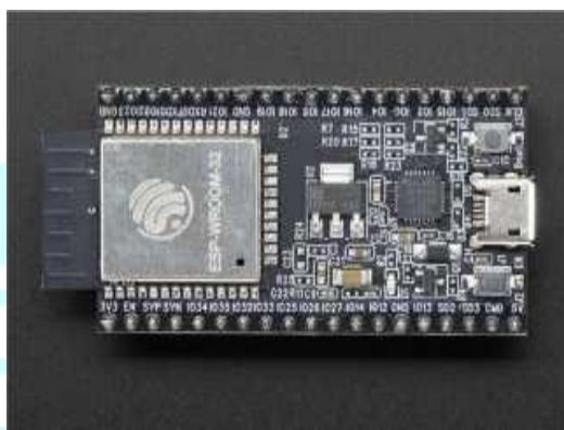
Figure 3.2.1 ESP32 microcontroller

One of the microcontrollers that supports both Bluetooth 4.0 (BLE) and Bluetooth Classic is the ESP32, which is an 802.11b/g/n integrated microcontroller (BT). Due to its low cost and low power consumption, the system is more advantageous for project implementation. This ESP32 microcontroller was devised, invented, and developed by ESP Resistor Systems and a Shanghai-based Chinese firm. TSMC produces it using their 40 nm technology. It occasionally links its own network. Through USB, it offers a power supply of around 5V. The ESP32 supports wi-fi Direct and is a viable alternative for peer-to-peer connections without the requirement for an access point.