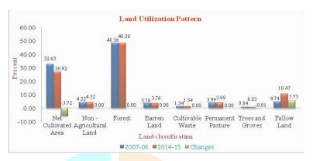
Figure 1: Land use changes in Chamarajanagara district

The Chamarajanagara district, most of the area under forest i.e. it occupies about 48.36 percent. The total area under barren land in the study area is 5%, cultivable waste 4.3% and permanent pasture 8.4% of both decades in total area of the district, this land has not variable from 2007-08 and 2014-15. Trees and groves decreased to -0.01%. The term fallow land is applied to land, not under cultivation at the time of reporting, but which have been under cultivation in the past. Fallow land with an average of 4.74% during 2007-08 and it largely increased in during 2014-15 (10.47%). In this decade the area increased to 5.73%.