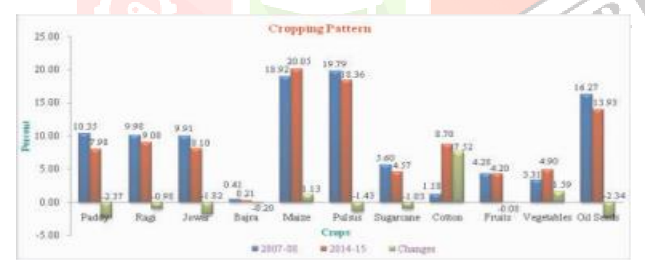
Figure 2: Cropping Pattern Changes in Chamarajanagara district

Source: Chamarajanagara District at a Glance - 2007-08 and 2014-15