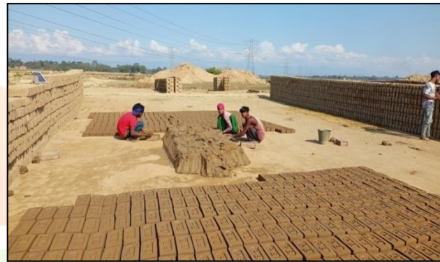
Preparation of raw bricks