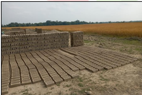
Conversion of paddy field to brick firm