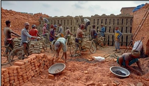
Workers inside the myan(kiln)