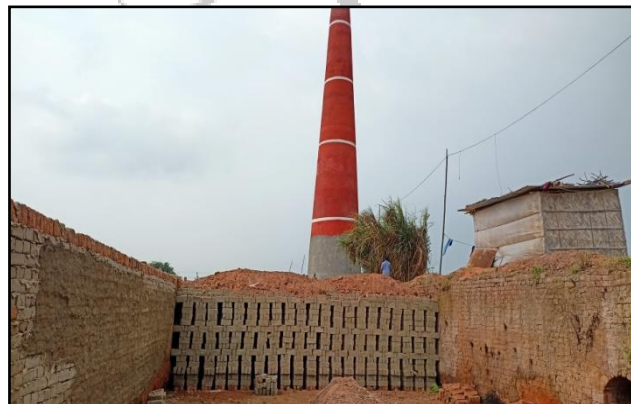
A myan(kiln) with chimney