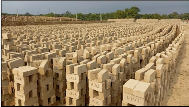
Drying of machine made raw bricks