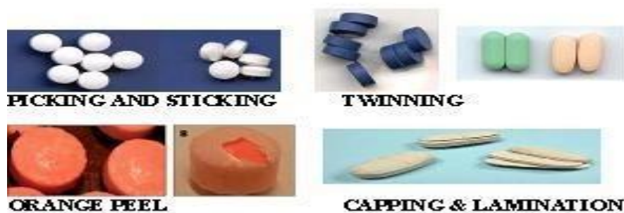
Figure No. 4: Pictorial Representation of Tablet Defects

An ideal tablet should be free from any disablement or purposeful defect. The advancements and innovations in tablet manufacture haven't cut the issues, often encountered in the production, instead have increased the problems, mainly because of the complexities of tablet presses; and/or the greater demands of quality. Majority of visual defects are due to inadequate fines, inadequate wet within the granules prepared for compression, thanks to faulty machine setting. Functional defects are due to faulty formulation. Solving several of the producing issues needs associate in depth information of granulation process and pill presses, and is acquired only through an exhaustive study and a rich experience. Here, we will discuss the imperfections found in tablets along-with their causes and related remedies (see table no. 4). Several tablets are being shown in figure no. 4. The imperfections are a unit legendary as: 'VISUAL DEFECTS' and that they are unit either associated with imperfections in anyone or additional of the subsequent factors: