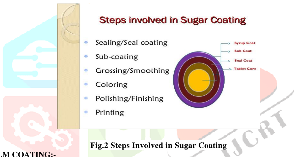
Fig.2 Steps Involved in Sugar Coating

If the following questions are answered concomitantly then one can go for film coating i.e. Is it necessary to mask objectionable taste, colour and odour? Is it necessary to control drug release? What tablets size, shape, or colour constrains must be placed on the developmental work?