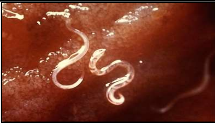
Fig No.2 Taxonomy