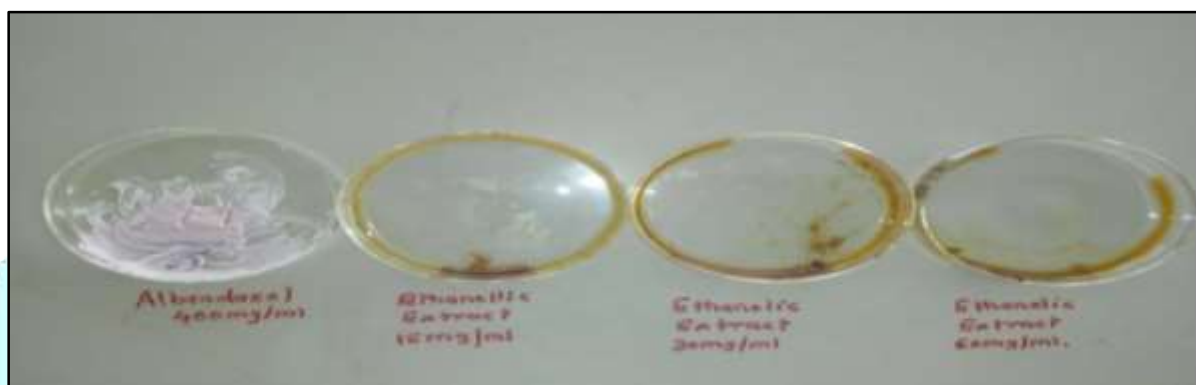
Fig No.4 Anthelmintic Screening of Ethanolic Extract.

Observations were made for the time taken to paralysis and death of individual worms. Time for paralysis was noted when no movement of any sort could be observed except when the worms were shaken vigorously. Death was concluded when the worms lost their motility followed with fading away of their body color