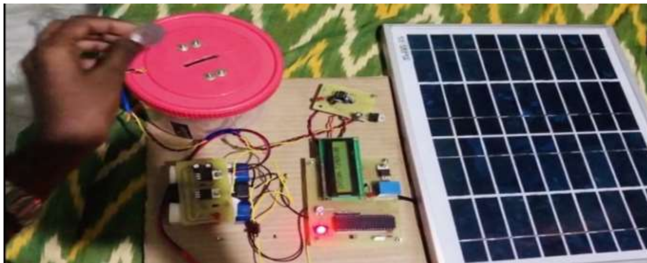
Fig.2: While inserting the coin

The figure 2 shows Insertion of coin to charge the mobile phone.