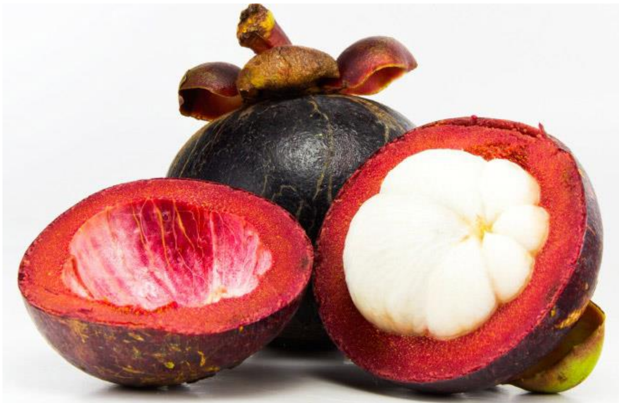
Garcinia Mangostana Fruit

Mangosteen peels contains anti oxidants and also helps in preventing cancer. The peel is dried and powdered which is used as dye extract. The fabric is dyed in post mordanting method where 5% of dye extract is used for dyeing and is shade dried and then the fabric is mordanted in alum solution with 5% of alum in the mordanting solution and the fabric is later shade dried.