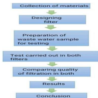
FIG 1 – METHODOLOGY

The following procedure was adopted for conducting the experiment: