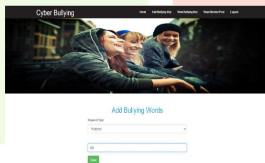
Figure 3: Add bullying words page

We tested the system with both Bullying and non-bullying words to ensure that the algorithm utilized in the system is robust. As predicted, the algorithm detected the bullying words and blocked the post until removal of bullying words.