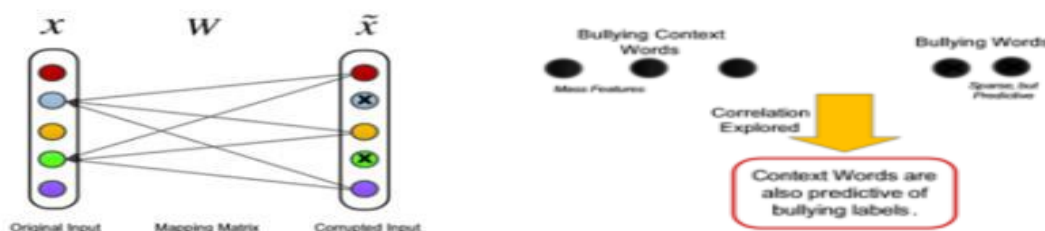
Figure 1: Data Processing

All the collected data will be segregated into five categories namely Violence, Vulgar, Offensive, Hate, Sexual each category will contain the set of bullying words.