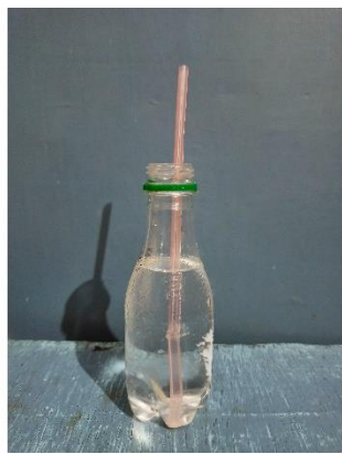
Figure 3.2 Bottle, Water, Straw.