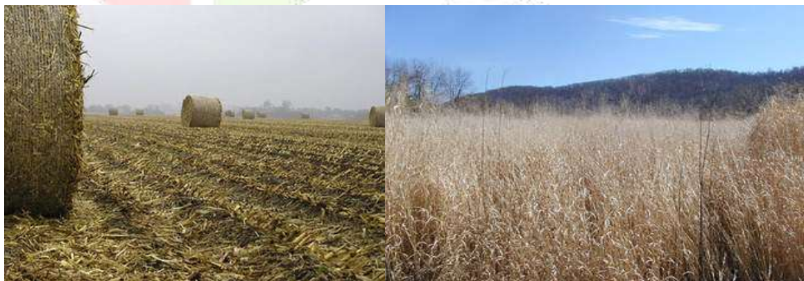
Fig.1- Lignocellulosic biomass- corn straw and switch grass

Lignocellulosic biomass is the most abounded waste material in the world, it is the structural portion of plants and includes agricultural and forestry residues, major fractions of municipal solid waste, herbaceous and woody crops grown as energy resources, for example corn stover which is all of the above ground portion of the corn plant, excluding the grain, sawdust, waste paper and yard waste, switch-grass, poplar respectively. These all materials comprise maximum 45–55% cellulose and 20–30% hemicellulose, and small amounts of lignin and other compounds sugars, oils, and minerals. Cellulose is a defined as polymer of glucose sugar molecules which are physically linked together in a crystalline structure which gives structural support for plants. In addition, hemicellulose is complex, amorphous, branched structure material present in plants. Lignin is a phenyl-propene compound that can be viewed as a low-sulfur, immature coal.